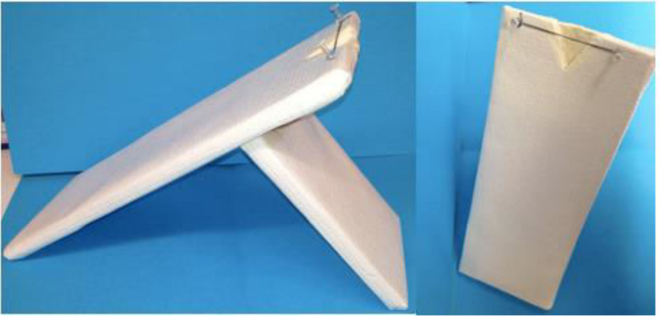
Figure 1. Representative Model of Intubating Platform