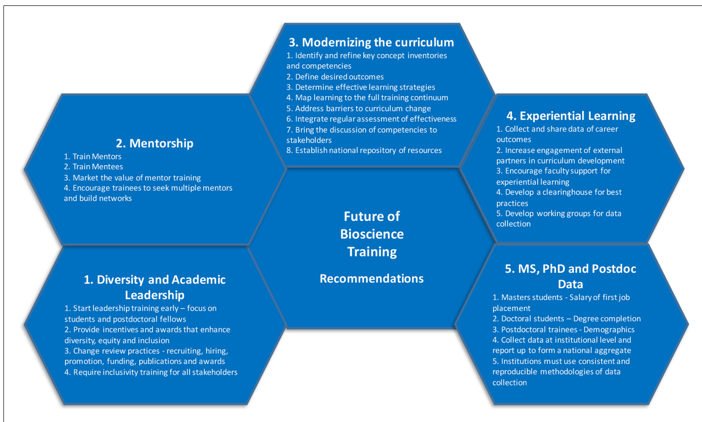
Figure 2. Recommendations from the second national conference on the Future of Bioscience Graduate and Postdoctoral Training. Each of the five working groups at the conference produced a list of recommendations aimed at academic and research institutions and funding agencies in the United States.

awards that already provide mentored training and protected time for advancement to faculty careers and/or leadership roles (such as division chief, chair and assistant/associate dean).