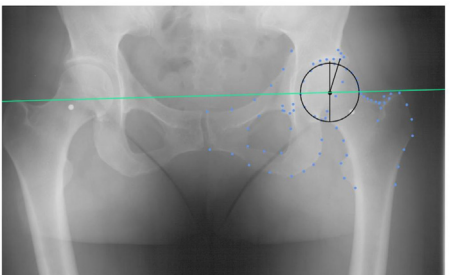
Figure 1. AP pelvic radiograph with automatic Bonefinder search model of hip shape (blue), horizontal reference line (green) and automatic calculation of WCEA (black).