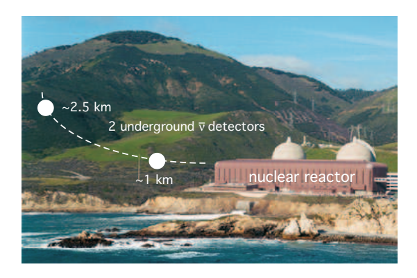
Figure 2. Concept of a 2-detector neutrino oscillation experiment at the Diablo Canyon nuclear power plant in California.

We have performed design and engineering studies on a future reactor neutrino experiment at the Diablo Canyon nuclear power plant in California, and more recently at the Daya Bay power plant near Hong Kong, China [5]. A horizontal tunnel can provide good overburden and access to the underground detector halls. The nearby coastal mountains provide overburden of up to 1200 meters water equivalent (mwe). Negotiations with the reactor operators are underway to develop a proposal for the construction of a next-generation neutrino oscillation experiment to search for \theta_{13} with a sensitivity of \sin^2 2\theta_{13} \leq 0.01 at 90% C.L..