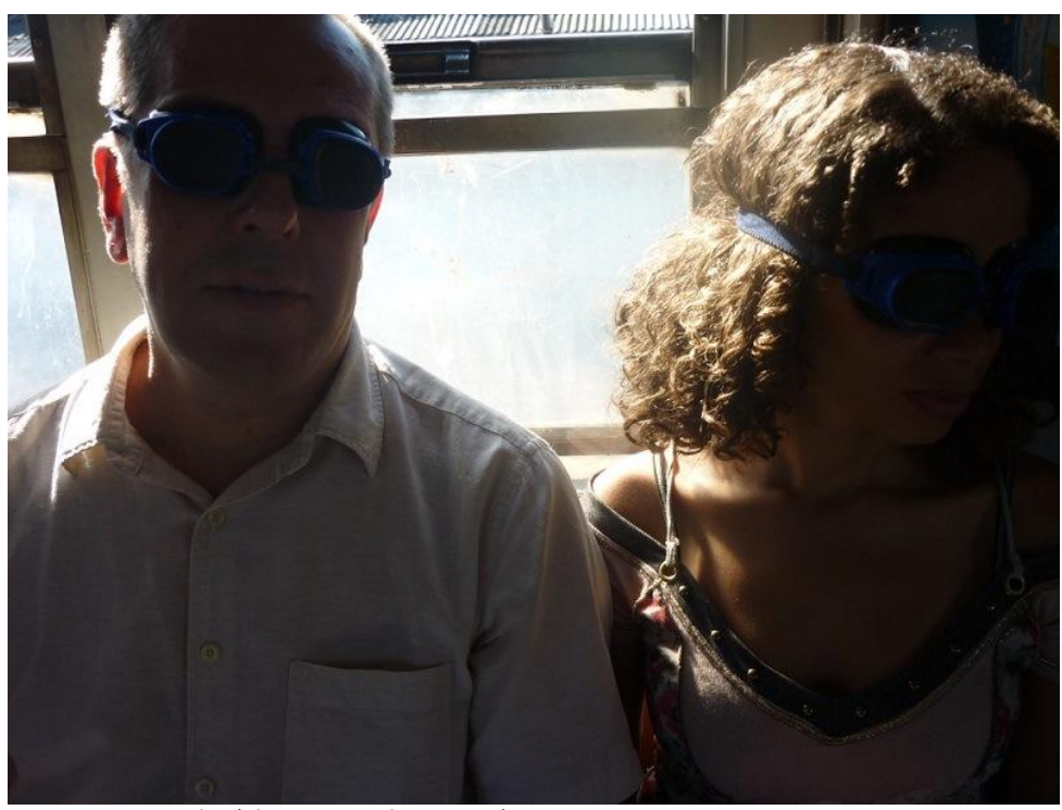
1: Protective Goggles.

Sailing is necessary, seeing isn't. If seeing isn't necessary, then conversation is. With the actors asking, we, blind spectators, exchange impressions of our inner journey. Not seeing anything and just hearing: what does it make you think?