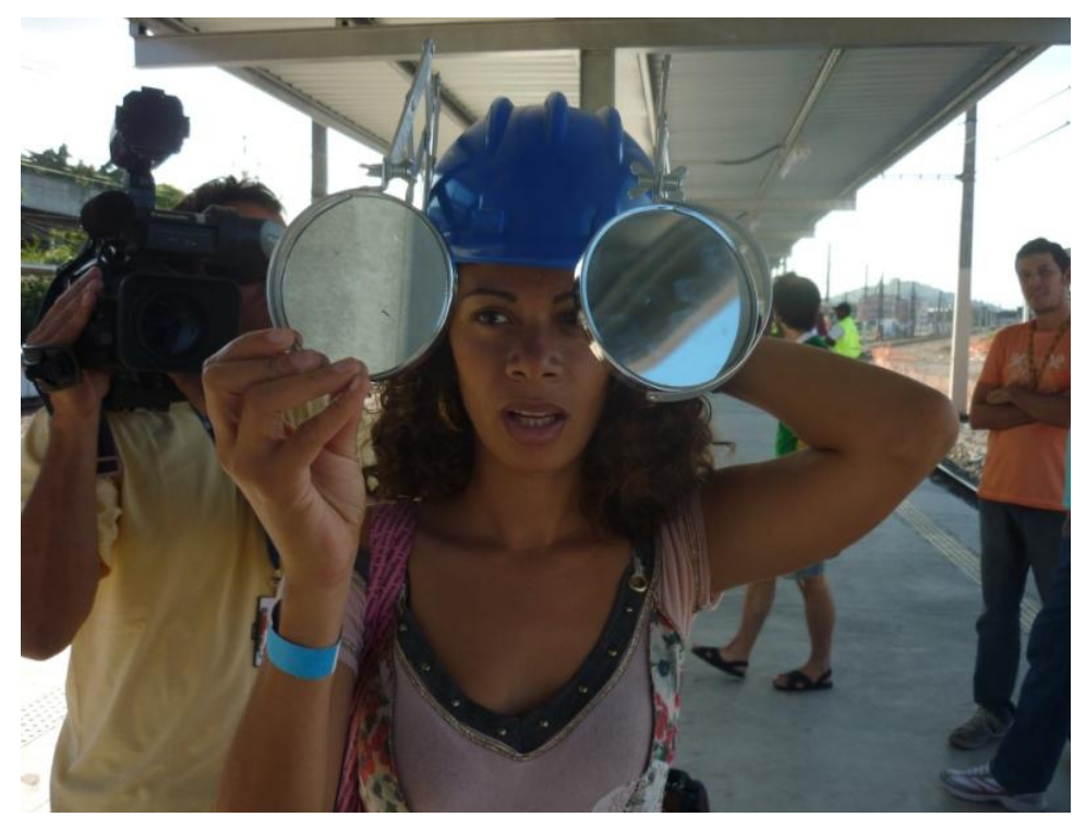
2: Memory Helmet.

If one walked backward, one would not need such device as a memory helmet, with mirrors in the front, to remember what is going on in the back. Since São Cristóvão station, we stepped out of blindness into a kaleidoscopic hyper-vision multiplying the points of view to the infinite in an attempt to see, as in Salvador Dalí's "paranoiac-critical method" (1971), what happens when you're not looking... Not long ago the actors were whispering their impressions to our ears, now they are screaming, arousing our memory. In a trance, they invoke and evoke the lost memory of the suburban archipelago. From Triagem station, the iron-colored sea has much history to remember.