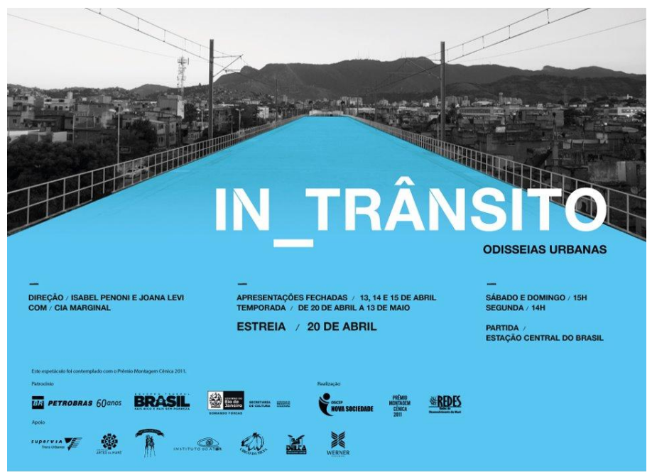
6: Poster for In_Trânsito.

Railway networks are like veins flowing; the stations are islands. Cyber-Olympic, potentially (or virtually...) without frontiers, the network city has in fact already entered the "culture-monde" (Lipovetsky and Serroy, 2008). Implicitly or explicitly, the rhetoric of the absence of frontiers traces the contours of a techno-culture that is progressively invading all landscapes: urban, suburban, sonic, visual, real, imaginary, symbolic, mental. As it becomes iconic, the "symbolic economy" (Miles, 2007) is producing new centralities: virtual, creative, mental, or moral – rather than strictly physical. Thus, the center is gradually shifting, from the idea of physical/geographical centrality, to the virtual/conceptual centrality of techno-culture itself – with all its current and future devices included. For cities and states, the cyber-Olympic dream is the current paradigm, the most secure way to successfully connect to the global network. You, without frontiers? And Rio too!