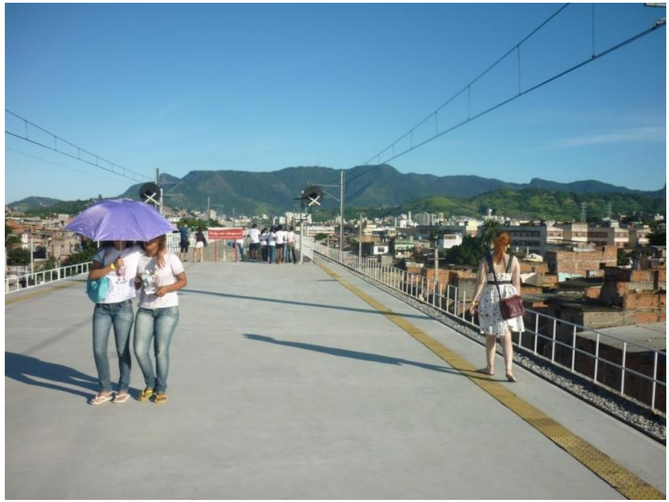
4: Manguinhos Station Platform.

Everything is Olympic now! It's all about Olympics! The Olympic City, the Olympic Village, the Olympic Port, We are all Olympic! This train is Olympic! The Indians are Olympic! The shopping is Olympic! The cable car too,... And the poor, is he Olympic too? But of course! And the favela,<sup>13</sup> is it Olympic too? Sure! All Olympic!