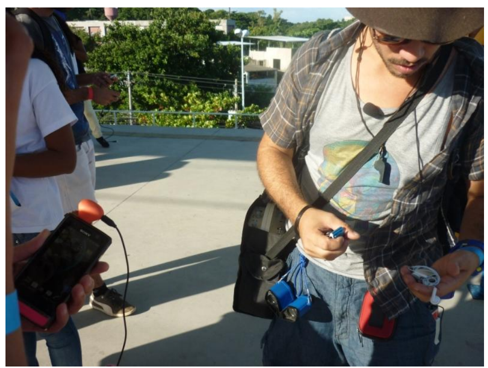
3: Headphones for Images.

"I see..." The actors show the way, we spectators follow them. At Manguinhos station, we exit the train. On Manguinhos platform: vision of the future, radical futurism, Olympic (pre)vision. The actors hand us headphones. Let us hear the soundtrack: let us listen to the landscape's images. The platform looks over destroyed houses – the pre-Olympic removal. We're walking around. At the horizon, green mountains remind other Mount Olympus. In the headphones, a voice keeps repeating: "I close my eyes and the pictures keep passing by..." The soundtrack is an obsession. Out there, the landscape shut up. Walking around, we look around the platform out there, still listening inside. "I close my eyes and the pictures keep passing by..."