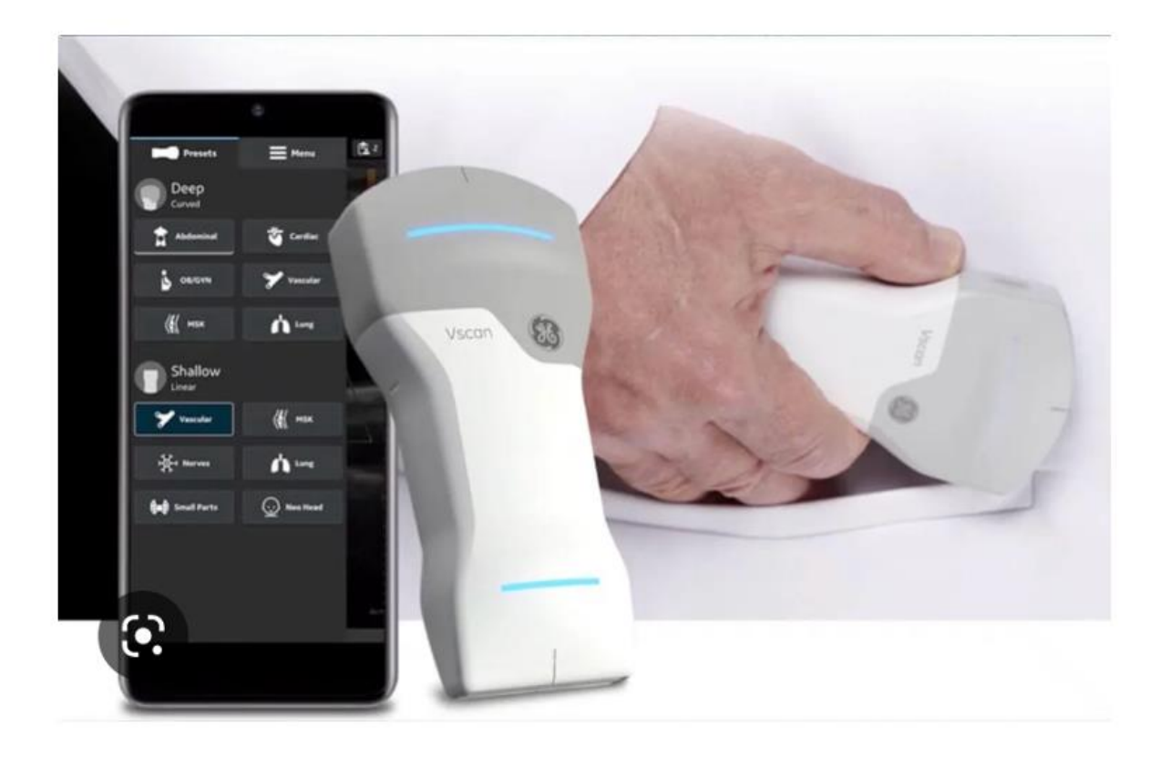
GE Healthcare: Vscan Air<sup>TM</sup> handheld ultrasound