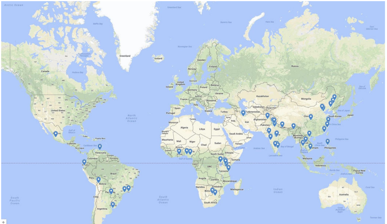
Figure 1: Hospital admission delay disaggregated by sex and region in all patients (A), where delay is defined as >24 hours, and open fracture patients (B), where delay is defined as >2 hours. Time is reported as the log 10 transformation of days to hospital admission.