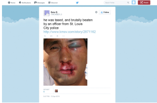
Figure 2: Mockup of a Twitter post from a fake Twitter user, Svie G, depicting an image of a battered and bruised face of man. The image was composed by layering three separate images. The swollen eye and the bloody lips were separate layers added to the man's face. His image itself was a cropped portion of a separate Flickr image from a political march in DC.

they then applied post hoc analysis to look for evidence and cues that supported their assessment. In other words, if a participant wanted to believe an image was authentic, they would find ways to justify their view. For instance, one of the mockup compositions was a doctored image of a battered and bruised face of man (Figure 2). The image was tweeted by a fake Twitter user, Svie G, who wrote "he was tased, and brutally beaten by an officer from St. Louis City police http://www.kmov.com/story/2871162. " The mockup also showed that the original post has been re-tweeted once. Instead of analyzing the qualities of the image, the participants mostly shifted their attention to the information provided in the post. One of the participants mentioned, "I have read stories like this, so to me it looks quite authentic," pointing to the fatal shooting of an unarmed teenager, Michael Brown, by a police officer in Ferguson, Missouri in 2014.