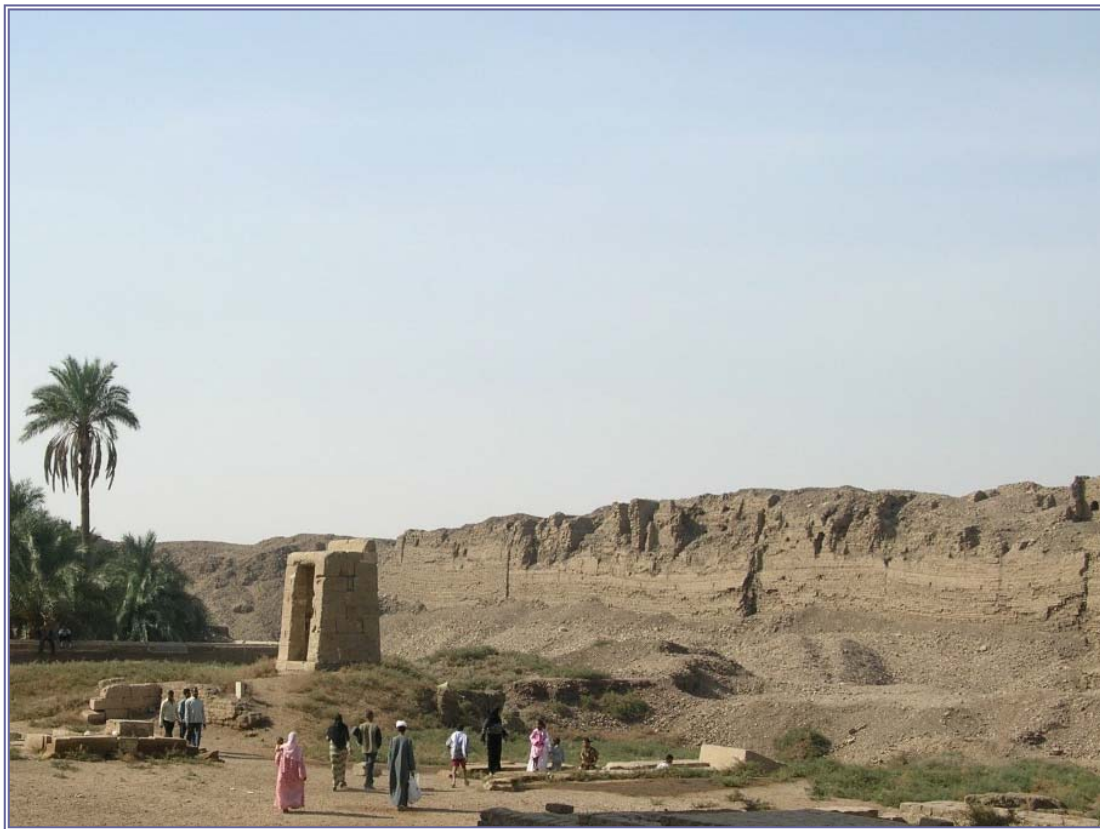
Figure 4. North temenos wall at Dendera showing concave and convex sections.

and mud-brick foundation walls dating to the reign of Senusret I at Tod, as well as the single spectacular example of the Satet Temple of Elephantine, the excavation of which revealed multiple iterations of mud-brick construction before an increasing number of stone architectural elements were added, starting in the 11 th Dynasty and continuing through to the 18 th Dynasty (Dreyer 1986: 11 - 36). Frequently, excavations have uncovered the temple enclosure walls contemporary with both early brick and stone temples, even when there remains little to no evidence of the original temple structure itself, as at Abydos and Medamud (Spencer 1979a: 62 - 63). Massive temple temenos walls became increasingly common through time, with many kings of the Late Period reconstructing enclosure walls, particularly with the expansion of temple precincts, as at Karnak and Elkab (Spencer 1979a: 64 - 82). These temenos walls were constructed in sections with either alternating convex and concave