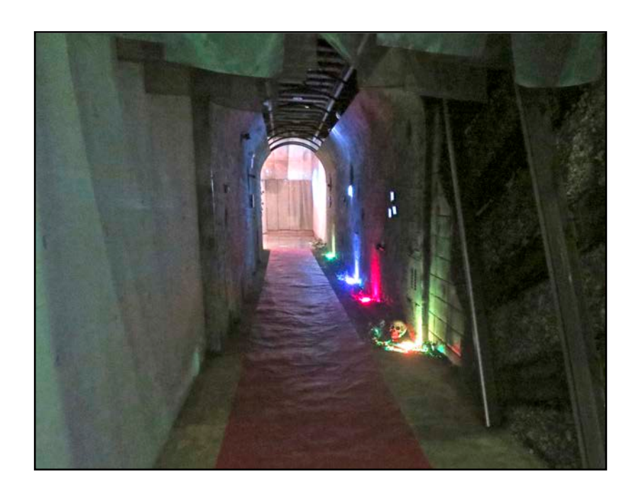
Figure 8. "Road of Lamentation," Nogunri Peace Memorial.