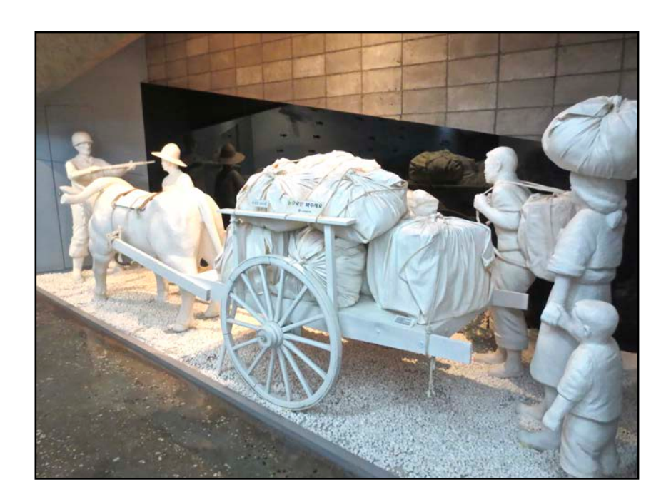
Figure 3. "Dragged Footsteps" sculpture, Nogunri Peace Memorial.

Downstairs, a life-sized white plaster sculpture titled "Dragged Footsteps" reproduces the familiar image of Korean War refugees: an ox-drawn cart, adults carrying bundles, mothers with their children (figure 3). In the front, a soldier blocks the refugees' footsteps with an M4 carbine. The whiteness of the plaster and the vacant expressions of the figures produce an eerie feeling. Across from "Dragged Footsteps" is a heavy metallic composition suitably titled "Tragic Memories of 1950's Summer: Road," in which two pairs of graphite military boots march along two parallel lines of skulls, shrapnel, bullet shells, and barbed wire (figure 4).