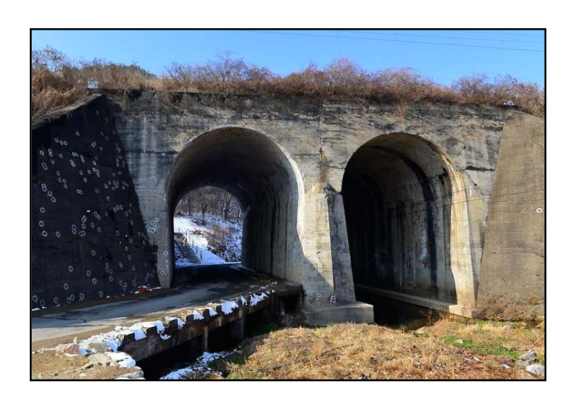
Figure 1. The twin tunnels at Nogunri, Yongdong County, North Ch'ungch'ong Province.

fleeing civilians by the twin tunnels that fateful day in 1950—are neatly displayed. The initial sense of isolation, emptiness, and unease one feels when encountering the park befits a memorial dedicated to an event that still remains largely marginalized in Korean history.