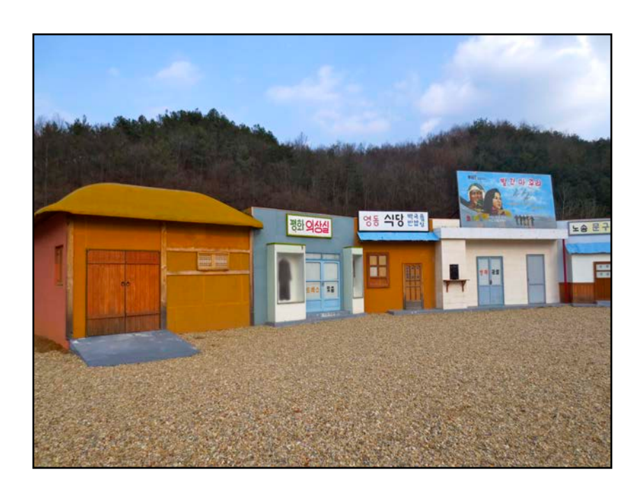
Figure 7. "Memory-Stirring Living Gallery," Nogunri Peace Park.

translucent, like ghosts haunting the tunnel; the sound of machine guns and bombs reverberate from within the passageway. In Korean only, a didactic message hangs at the entrance: "Experience the fear of those who perished in the twin tunnels."