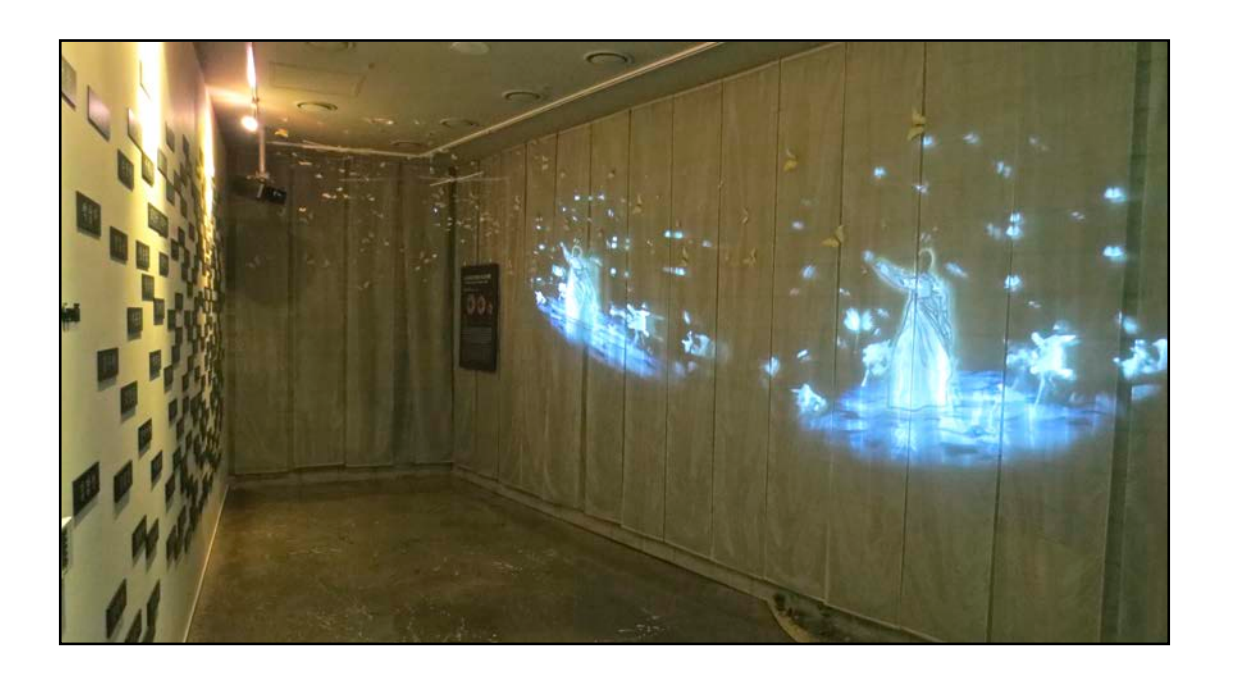
Figure 5. "Mortified Souls: In Memory of Nogunri," Nogunri Peace Memorial.

To be fair, the dead are not entirely absent from the memorial and park. In a small foyer leading to the upper level, under the heading "Mortified Souls: In Memory of Nogunri," small wooden plaques are inscribed with the names of those who were killed in the Nogunri Massacre (figure 5). Outside, beyond the towering commemorative monument, a steep fifteen-minute trek up the hill, is the Nogunri Incident Victim Cemetery (figure 6). Twenty-eight graves are marked by tombstones; the majority of the victims, whose bodies were shattered beyond identification, are laid to rest in three collective tombs. While the cemetery is noted on the Nogunri Peace Park brochure (it is listed as number 18, after the Facility Maintenance Office), it is hidden behind the rolling hills. Much like the touch-screen monitors, it requires initiative on the visitor's part to visit the cemetery.