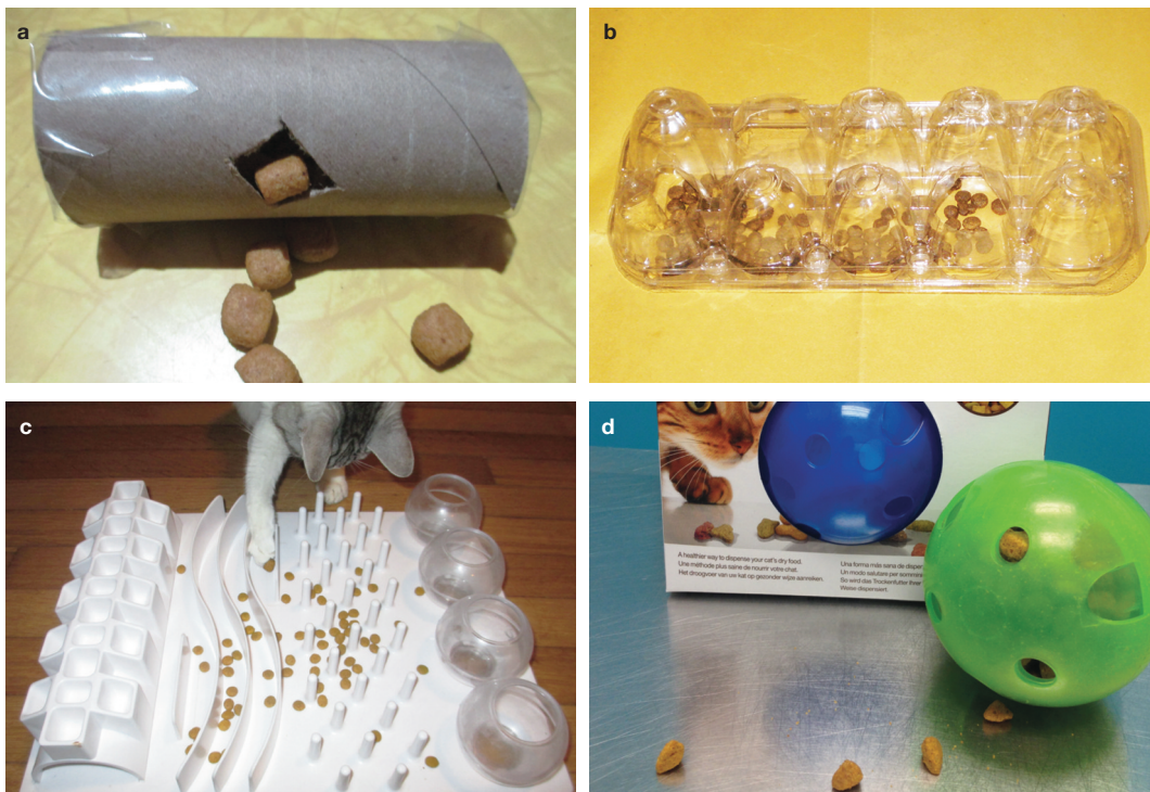
Figure 1 Homemade mobile (a), homemade stationary (b), purchased stationary (c) and purchased mobile (d) food puzzles.

Presenting some challenge that is appropriate to an animal's natural ecology and matched to its skill level is likely to provide cognitive, physical and behavioral benefits.