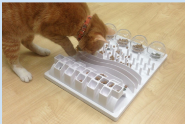
Stationary puzzles can be used with wet and dry food.

For slow starters , place small handfuls of dry food in locations frequented by the cat (condos, window sills, beds.). This allows the cat to discover food in novel places.