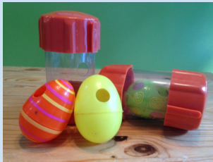
Some examples of rolling food puzzles.

Food puzzles are an excellent way to increase your cat’s activity and mental health by giving them a new, more natural way to get their food by “hunting” for it. Food puzzles typically come in two styles, rolling and stationary. They can be purchased or homemade, and can be used with dry or wet food, or treats.