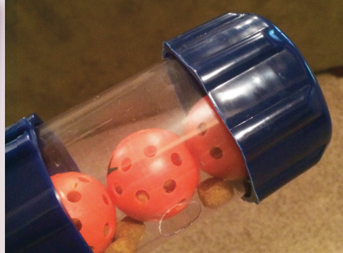
Figure 4 Placing a small puzzle inside a larger puzzle increases the challenge for cats.