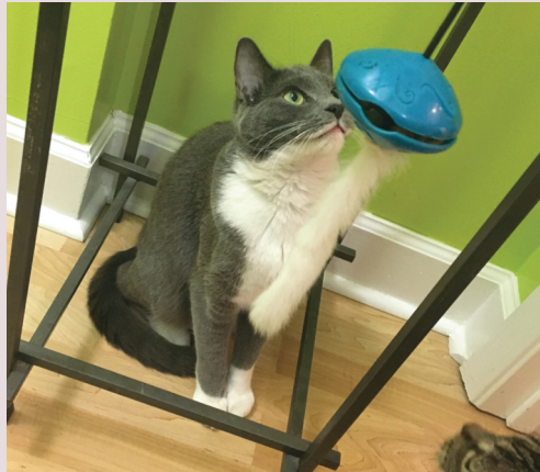
Figure 5 A piñata-style puzzle that hangs.

Food puzzles should be introduced as part of a multimodal enrichment plan.