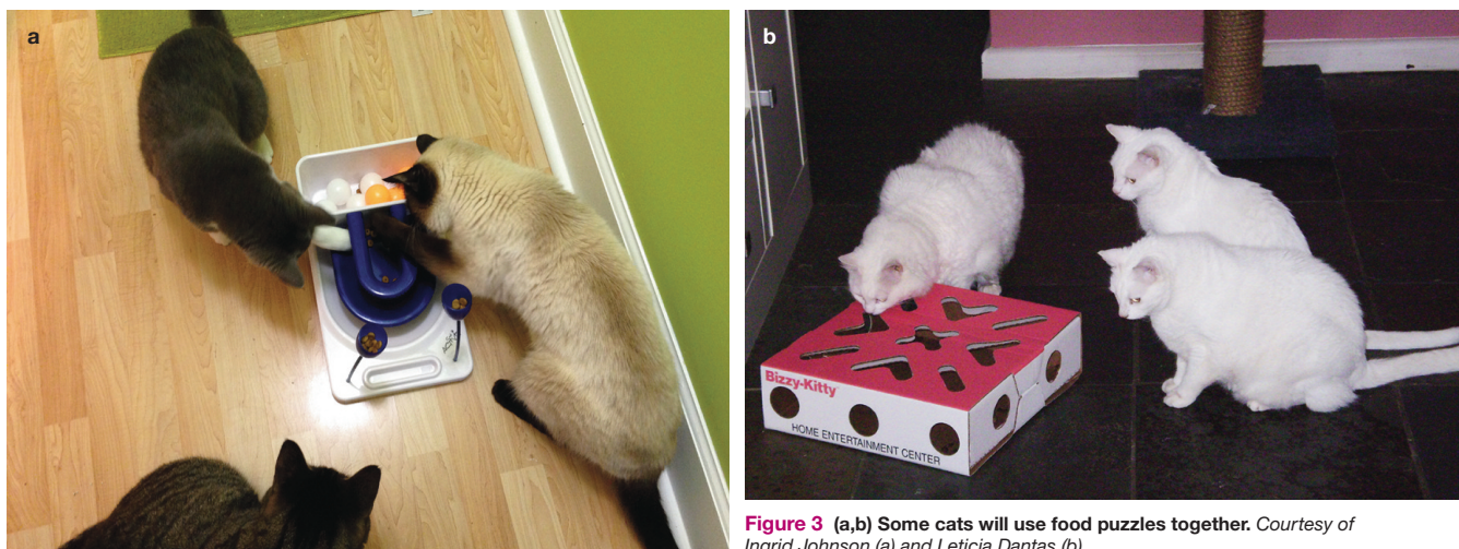
Figure 3 (a,b) Some cats will use food puzzles together.

can be used in select rooms (eg, bathroom, office, kitchen), or in more restricted areas such as bathtubs, laundry baskets, under-the-bed storage containers or in the lids of large storage totes. The downside of restricting the area the puzzle is used in is that it makes food easier to obtain, and reduces the cat's movement and activity; and bathtubs and containers may provide other challenges for any cat with a mobility issue (such as older, arthritic cats).