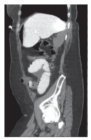
Figure 1: CT with oral contrast, sagittal view.