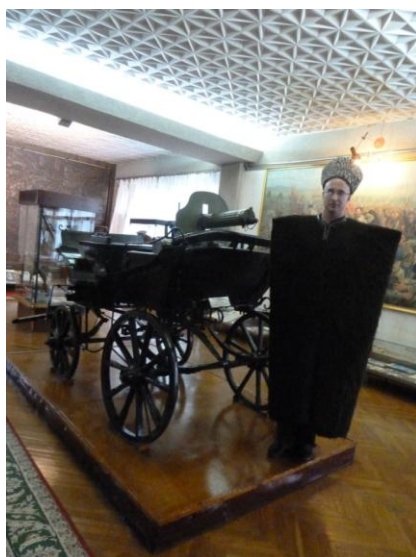
The author at the V.I. Chapaev Museum in Cheboksary, Russia

Both Makhno and Chapaev were charismatic Civil War leaders, extremely popular among the peasantry, whose loyalties were perceived to be suspect or unreliable. 329 During the 1920s, Leopold Averbakh (the leader of the Russian Association of Proletarian Writers, or RAPP) wrote an article in which the Chapaevshchina (the Chapaev ‘phenomenon’ or ‘movement’) was characterized as “of the same essence as the Makhnovshchina ”. 330 In both Furmanov’s diary and novel, Chapaev is portrayed as a potential Makhno and the author’s motivating impulse is to deconstruct this false heroic image. Yet this very image of Chapaev as a peasant hero – brimming with visual dynamism, boundless energy, and the kind of innate cleverness encapsulated in the tachanka —is central to the popular appeal of the film. In the film, Chapaev’s loyalty to the Bolshevik cause is never in question. When Chapaev and Pet’ka appeared onscreen in a tachanka , they appropriated its symbolic power (i.e. the ingenuity and fighting spirit of the countryside) while simultaneously eroding the memory of Makhno. 331