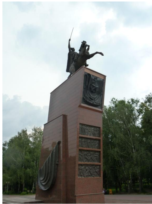
The statue outside the museum in Cheboksary

The monument quickly became an important site of social interaction: a nexus for Chapaevtsy . The term, which initially referred specifically to those who had served under Chapaev during the Civil War, eventually came to embrace all veterans of the 25 th Division (even those who had enlisted long after Chapaev's death). After it was placed under the