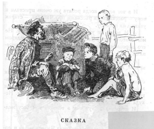
A. Kononov, Rasskazy o Chapaeve , 53.

The stories contained in the collection follow a similar pattern. In some ways it resembles the 1938 ‘folklore’ collection Chapai , with historically plausible episodes (reinforced by the specific names of people and places) existing alongside less probable anecdotes. Nevertheless, the only truly ‘fantastic’ episode comes towards the end of the collection, immediately following Chapaev’s death, and is clearly delineated by the heading Skazka (A Tale).