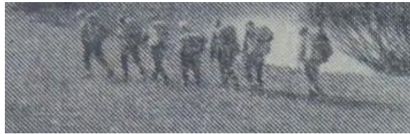
Members of the Saratov Pedagogical Institute's 1987 Chapaev expedition (from Kommunist June 24, 1987)