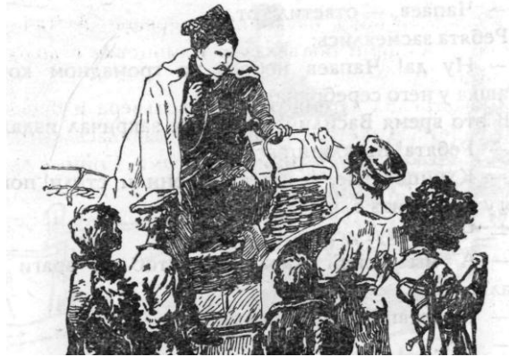
A. Kononov, Rasskazy o Chapaeve , 18

The stories contained in the collection follow a similar pattern. In some ways it resembles the 1938 ‘folklore’ collection Chapai , with historically plausible episodes (reinforced by the specific names of people and places) existing alongside less probable anecdotes. Nevertheless, the only truly ‘fantastic’ episode comes towards the end of the collection, immediately following Chapaev’s death, and is clearly delineated by the heading Skazka (A Tale).