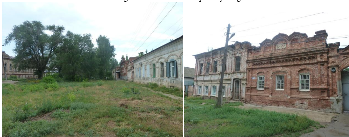
Grass and tress now grow on what was once the main street in Balakovo and much of the old center is a ghost town.

The tourist potential of a memorial site required more than just symbolism. This had to be combined with accessibility to the centers of Soviet civilization. In Chapaev country, this was increasingly determined by accessibility to riverboat traffic. Soviet citizens wanted to visit Civil War sites and Chapaev House-museums, but many of them wanted this to be part of a leisurely family cruise down the Volga. Balakovo’s potential as a major site for tourism was undermined by the construction of the Saratovskii hydroelectric plant during the period from 1956-1971. The course of the river was shifted away from the historic city center and a canal re-routed river traffic through a previously underdeveloped region of the municipality. The historic city center, once vibrant and full of interesting architecture subsequently stagnated.