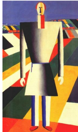
Kazimir Malevich, “Peasant in the Fields” c. 1929

narrator claims that “anthropologists who have devoted their efforts to studying the ‘New Russians’ believe that these winches are used as rams during the settling of accounts, and certain scholars even see their popularity as an indirect indication of the long-awaited resurgence of the spirit of the nation—they believe the winches fulfill the mystical role of the figureheads that once decorated the bows of ancient Slavonic barks.” 717 Volodin and his fellow mobsters are eminently physical “nothing but an intersection of simple geometric forms” with a “small streamlined head...reminiscent of that stone which according to the evangelist was discarded by the builders but nonetheless became the cornerstone in the foundation of the new Russian statehood.” 718 Pelevin’s ‘New Russians’ thus turn out to be Malevich’s peasants (eminently physical but without depth—they are surfaces, not beings).