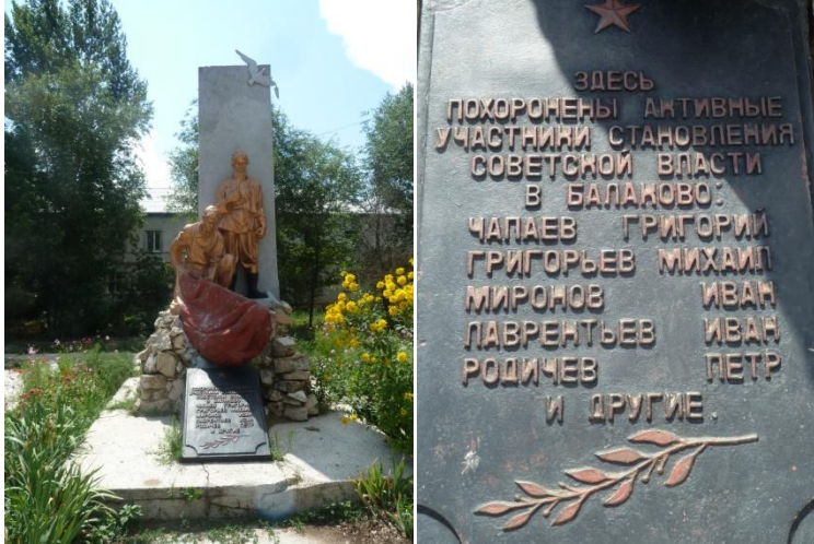
All photos in this chapter taken by the author unless otherwise noted

The town of Balakovo, and its Chapaev House-museum, stressed this fact. An article from 1957 with the title “The Carpenter from Balakovo” describes the town, and the little Chapaev house, as the place where the hero “began his working life ( nachal svoi trudovoi put' )” and claims that “many people in Balakovo remember Chapev as a youth.” It notes that “many things in the city are connected with the Chapaev family” and recounts the story of Grigorii’s death there. 499 Not only did the House-museum showcase the domestic atmosphere of the Chapaev family and emphasize the fact that the house itself was built by Vasilii Ivanovich and his father and brothers, it displayed several objects made by Chapaev himself. 500