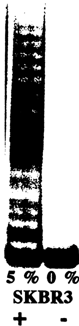
Fig. 2 Telomerase activity was detected in artificial single frozen section mixtures of the SKBR3 cell line and primary human fibroblasts. Telomerase activity was detected when as few as 5% SKBR3 cells were present (+) but was not detected (-) when SKBR3 was absent (0%). The total number of cells is approximately constant between the specimens.