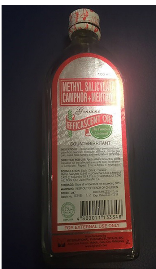
Image 3. Empty container of Efficascent Oil, a topical pain-reliever containing camphor and methyl salicylate.

There are also combined medicines that include aspirin with other oral medicines such as Percodan® and Excedrin®.