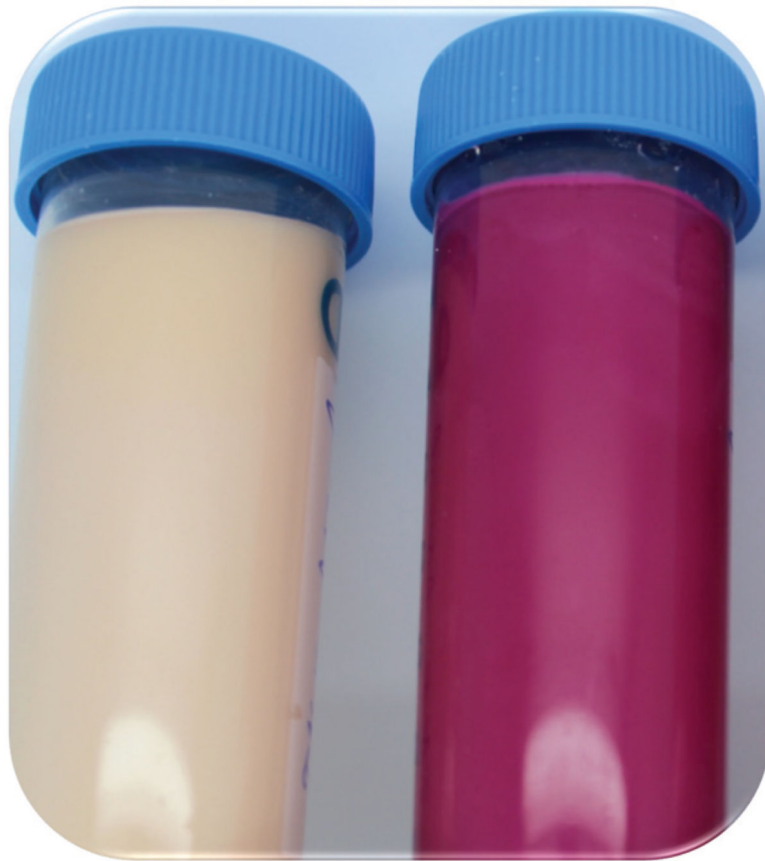
Figure 1. Left, unheated phantom sample, and right, phantom sample heated to 65°C for 30 min using a hot water bath.