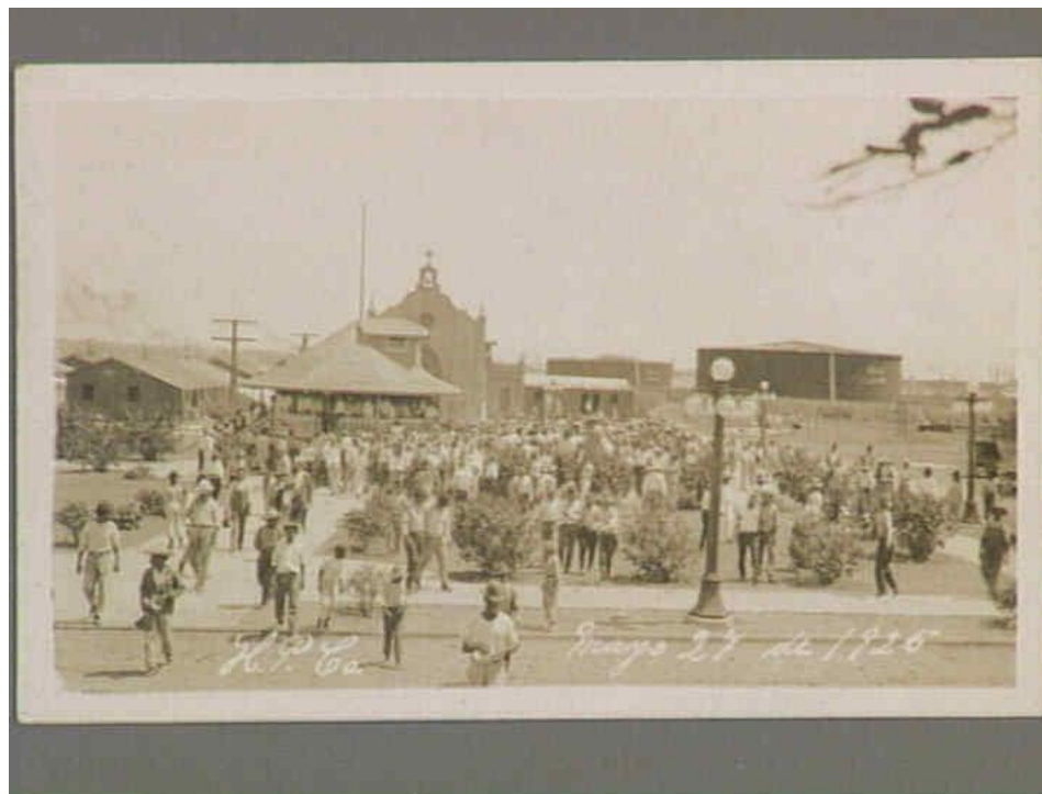
Figure 5: CGT Meeting in Mata Redonda, Veracruz (May 27, 1925) 41