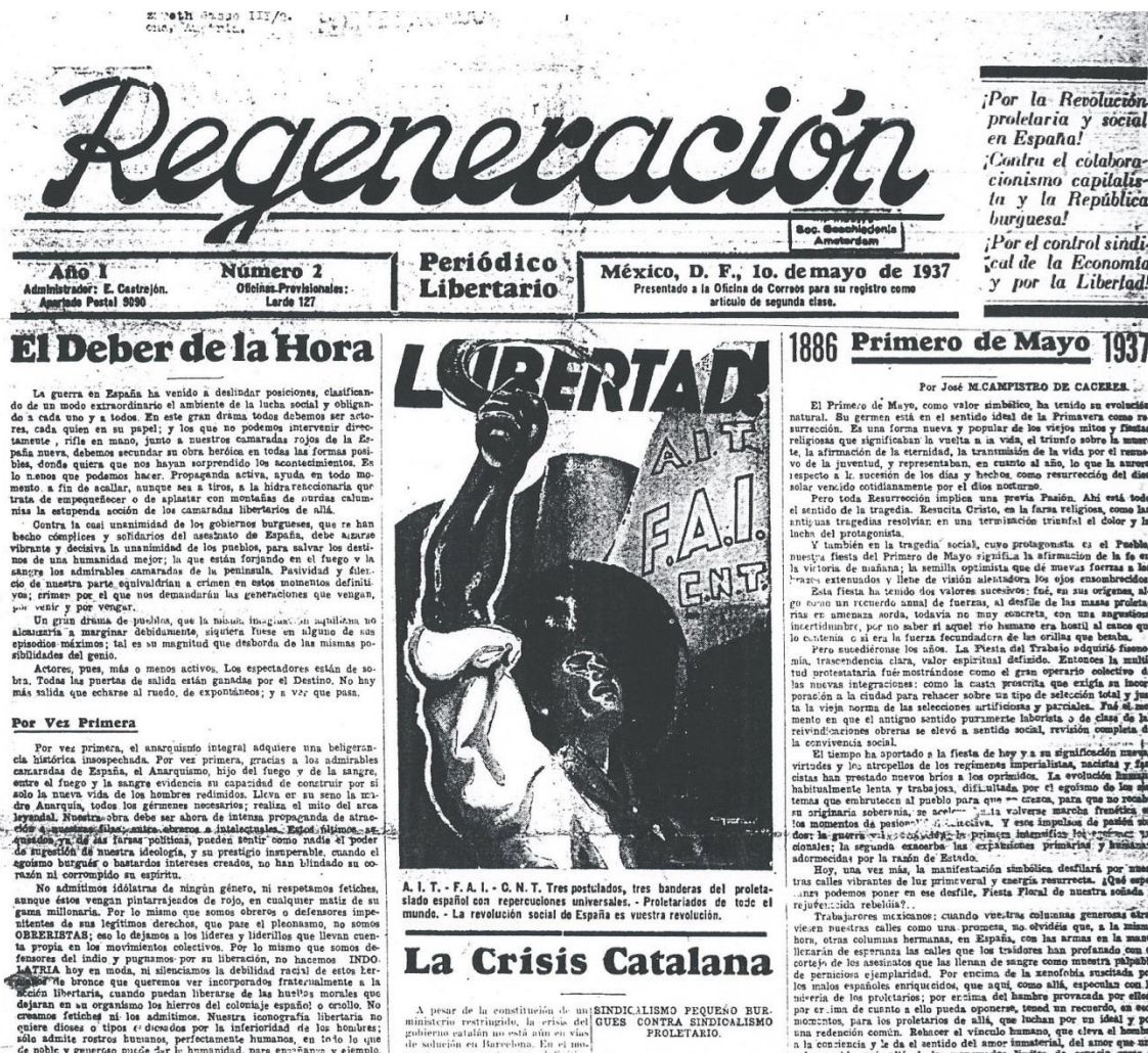
Figure 7: Regeneración: Periódico Libertario (May 1, 1937, Mexico City) 33

Not only were the editors of Regeneración promoting the continuing identity of Mexican revolutionaries, but taking clear stances on internal conflicts within the Mexican anarchist movements. Despite the distance from the battlefields of Spain, the ideological struggle of maintaining and preserving the ideals fought for by anarchist contingents found its way into the debates of the Mexican anarchist press.