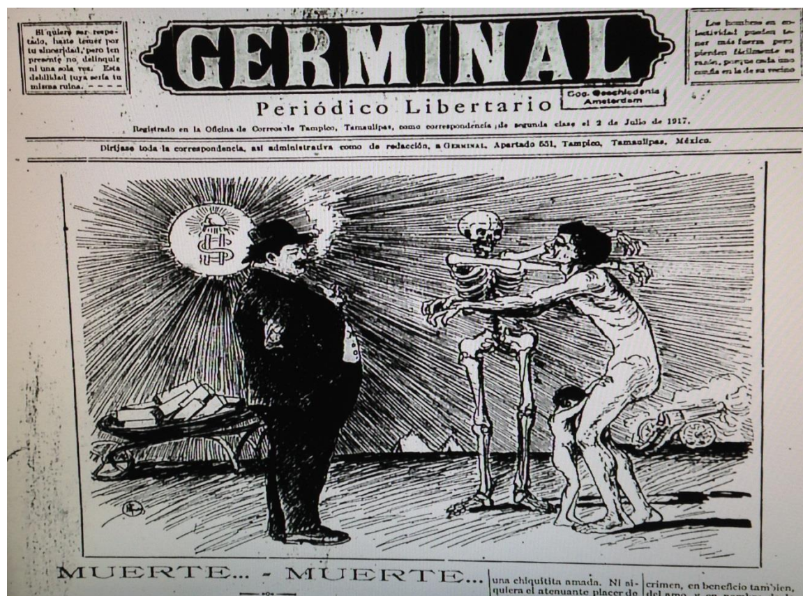
Figure 1: Germinal: Periódico Libertario (July 1917, Tampico, Tamaulipas) 71

Enrique Flores Magón's argument for traditional collectivist practices found in rural indigenous and peasant communities. The acknowledgement of multiple paths towards a tangible anarchist revolution further enhanced the Tampico branch's relations to the city's working class communities, though elements of the state-consolidation impacted the branch's organizing capacities.