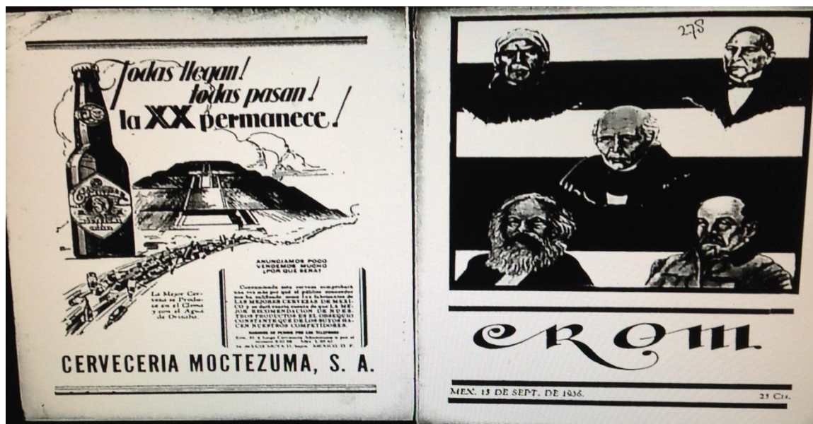
Figure 6: CROM periodical (September 13, 1936) 13

obvious capitalist and nationalist sentiments that seemed to be virulently at odds with each other, they also demonstrate a clear ideological synthesis of the CROM's positions within the labor movement.