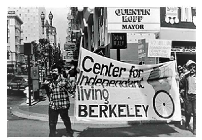
Staff members at the Center for Independent Living (CIL) carry a banner with an illustrated fist rising from a wheel and the words "Center for Independent Living Berkeley" through the streets of San Francisco.