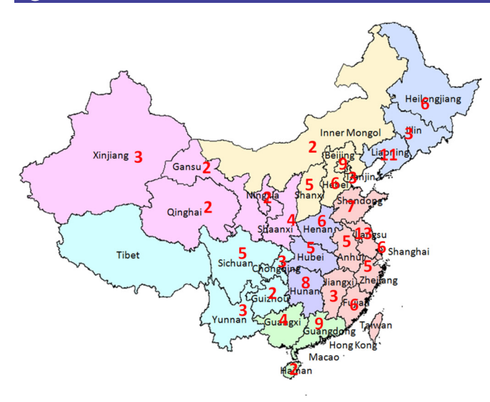
Figure 1 Distribution of hospitals for the Improving Care for Cardiovascular Disease in China-atrial fibrillation programme. Numerals on the map indicate the number of hospitals in the area. From Hao et al. <sup>18</sup>

improvement (from 45% to 51%) in primary composite score means that >6% guideline recommended treatments will be correctly given for patients with AF. Researchers from SMG, project management group and participating hospitals have the access to analyse the data in a de-identified way, in both hospital level and patient level. Categorical variables are presented as frequencies and percentages and continuous variables are as means and SD or medians and IQRs. Missing data are managed based on the purpose of the study and analysis method used. The \chi^2 trend test is performed to evaluate the temporal trend of performance measures. Univariate and multivariable analysis are performed to recognise the element related with outcomes concerned, for example, the implement of specific treatments and in-hospital events. To address intrahospital correlation, generalised estimating equation models will be applied. All statistical analyses are performed by SAS V.9.2 (SAS Institute). Two-sided p values < 0.05 are considered statistically significant.