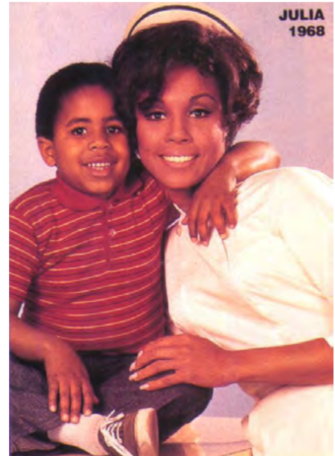
Diahann Carroll starred in Julia from 1968 to 1971, as nurse and a single mother balancing a career, parenting, friendships, and dating.