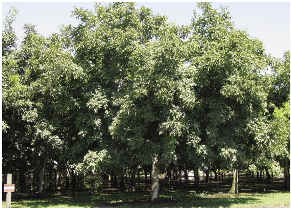
Careful rootstock selection can help to prevent blackline infection. Above, healthy walnut trees on English rootstock (variety 'Chandler') in an orchard near Linden.