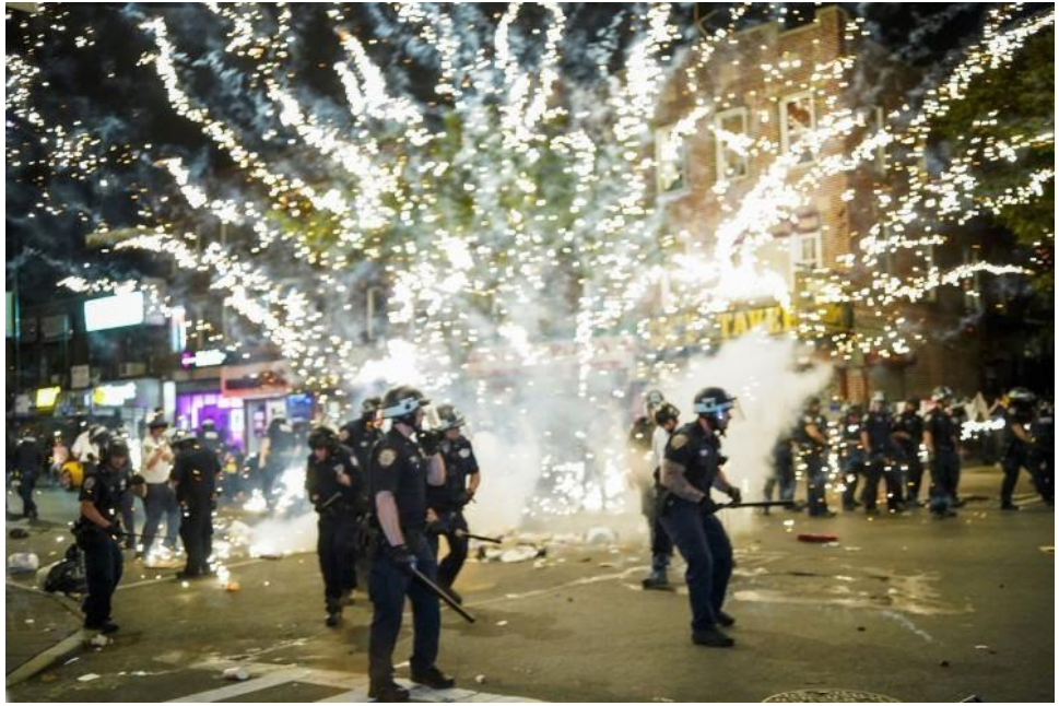
Fig. 2. "Fireworks explode on a group of NYPD officers during a clash with George Floyd protesters." The New York Post, June 15, 2020. Fueled by the desire to challenge authority, illegal fireworks punctured the urban soundscapes. Between June 1-June 14, 2020, there were 849 fireworks complaints on 311; in 2019, only 21. https://nypost.com/2020/06/15/illegal-fireworks-complaints-in-nyc-soar-under-lockdown

night after night, firecrackers would go off, one after the other, or many at once, on and on, all night long. They sounded like gunshots, except, who was so rich to have so much ammunition? If you listened long enough, you could identify the general direction where they were coming from. At home, we were guessing, this must be from a block away, from the building between Rogers and Bedford. Or, this must be two blocks away, from the buildings on Clarkson. Sure enough, when we walked around these areas in the morning, we would see the now empty packages of firecrackers, oh, so many of them, next to empty bottles of Hennessy. Why so many firecrackers? Where did they buy them? Perhaps they ordered them on Amazon? Boxes and boxes of firecrackers. All made in China. How much money was spent on these firecrackers? They were the response of residents crazed from the pandemic, staying inside for too long, people who could not do what they like to do and when they like to do it and who they like to do it with. It was their way to mark their territory by perhaps celebratory perhaps aggressive sound, saying, we are still here, and we don't care if we disturb everyone, we are alive, and we choose to crack these firecrackers because yes, it is illegal, but yes, we can do it. And we can keep doing it (Fig. 2).