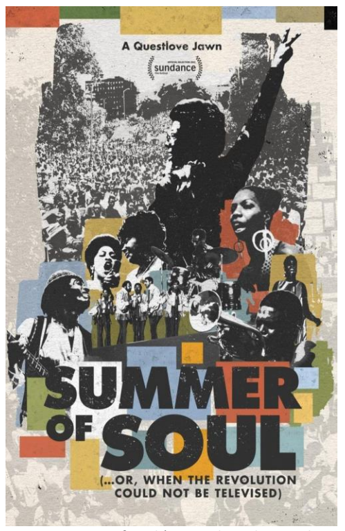
Fig. 4. Summer Of Soul (...Or, When The Revolution Could Not Be Televised), 2021. Dir. by Ahmir "Questlove" Thompson. https://www.stereogum.com/2145420/summer-ofsoul-questlove-documentary-trailer/news/

When I saw Summer of Soul (...Or When the Revolution Could Not Be Televised) (2021), the music documentary based on the forgotten 50-year-old raw footage from the 1969 Harlem Cultural Festival held in Mark Morris Park in Harlem, NYC, which was just recently produced by Questlove (Fig. 4), I was filled up with memories of those great summer concerts in the parks of New York City that have been lost to the Covid-19 pandemic. Although D. A. Pennebaker's famous music documentary Woodstock Diaries (1994) about the same summer of 1969, aka, the Summer of Love, too shows an impressive lineup of unforgettable talent, it does so in the context of upstate New York (as well as free love and the hippie movement). Summer of Soul, however, showcases black music genius in the context of urban America.