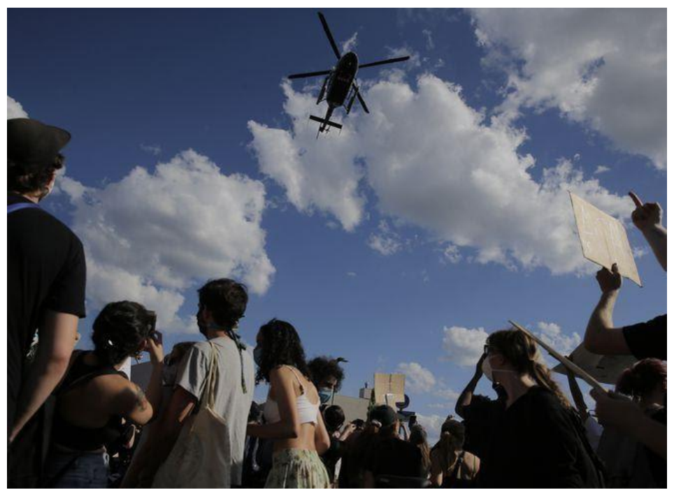
Fig. 1. "Protesters react to a low flying helicopter during a march on May 30, 2020, in Brooklyn." The Gothamist , June 23, 2020. To surveil and intimidate protesters, helicopters flew as low as 500 feet. A helicopter costs about $10 million; fuel and other expenses – about $1,600 per hour. Between May 29-June 16, 2020 four NYPD helicopters monitored protests for a total of 186 hours. <u>https://gothamist.com/news/how-low-did-those-nypd-helicopters-go-recent-protests</u>.

The helicopters captured the fear: the fear of the protesting masses, of movement on the ground, of community work, of citizens who have had it, of people who were too sick of senseless murders, of those who couldn't flinch in the eye of the virus. The helicopters produced an auditory assault; they were the tool of sound terrorism that was supposed to make everyone afraid, to make everyone fearful of people getting together, and to anticipate danger where danger did not really exist. The sound attack of the helicopters was the only way for the NYPD to feel in control over a situation that they had long lost control over, or never could control in the first place (Fig. 1).