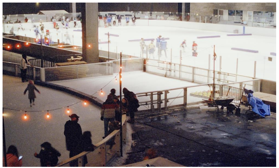
Fig. 3. LeFrak Center at Lakeside, Prospect Park, Brooklyn, New York. January 2021.

...We were not only ice skating, we were dancing: the spirits were high, everyone was talking to everyone...new friendships were formed, old friendships were rekindled...our conversations were filled with fun: despite the masks, we could hear each other talk, laugh, sing. No one dared take a break from the rink: the energy had us all roped in: what if we missed the best song?! We anticipated each song with the excitement of a kid in a toy store, at awe with each selection. Everyone: regulars and newcomers, current and former workers, welcomed this new but exciting character to every conversation: the good music! The good music helped create a great mood, which we all shared together. We were all ice skating but more than that, we were actively building togetherness, against the loneliness and the fears and the uncertainties. This was the party we had longed for, for a whole pandemic year, where music did its best: brought us all together, to enjoy each other's company, and create a community. On Saturday nights, from 7 to 9 pm, everyone belonged (Fig. 3).