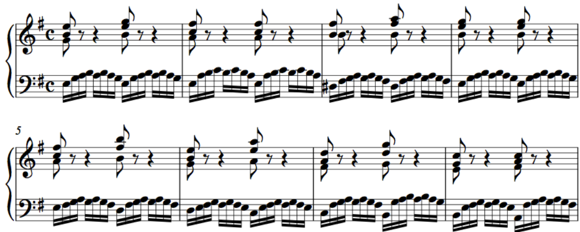
Figure 2.1. Characteristic figuration in Bach's Clavierbüchlein , Preludium in E minor, mm. 1-8.

challenge of a lefthand moto perpetuo with increasingly large extensions in the little finger with chordal punctuations in the right hand (fig. 2.1). Bach retained the piece's sixteenth-note figure and harmonic structure, but augmented it in two ways: first, by adding a florid melody in the right hand (fig. 2.2a), and second, by almost doubling the piece's overall length from twenty-three to forty-one measures through the appending of a new section marked Presto in which both hands take up the initial figure (fig. 2.2b). The adult version rests upon the foundation of the original version, revealing Bach's compositional process of developing and refining a musical idea.