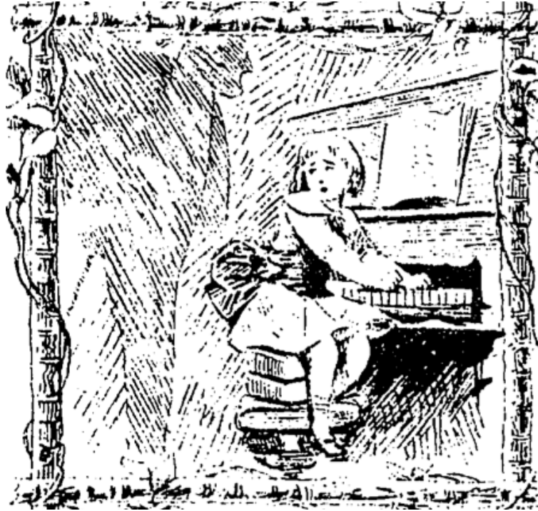
Figure 4.13b. Cover illustration of Yvonne weeping in Lack's Scènes enfantines .