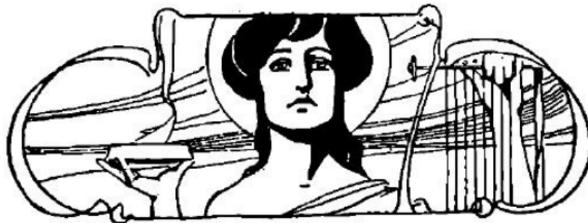
Figure 3.4. Russian Musical Gazette article illustration for Akimenko’s serial monograph “Life in Art.”

timelessness, but anthropomorphizes music as an idealized female figure. Every installment of the monograph includes a small illustration of this personified essence of musical Art: a regal, haloed, and dark-haired woman stares through a wispy Art Nouveau-style frame at the reader with a lyre clasped in her left hand and a bowl of smoking incense held up in her right (fig. 3.4).