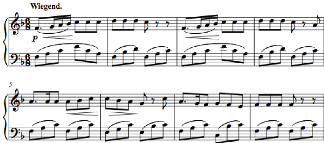
Figure 4.2c. Gurlitt's "Puppenwiegenlied," Aus der Kinderwelt , mm. 1-8.

The thirteenth piece of the collection, "Das kranke Brüderchen" (The sick little brother), subtly varies the musical materials of "Schlummerliedchen" to depict a sick child in bed. Now in E minor and marked Sanft klagend (gently sorrowful), Gurlitt uses the same lilting 6/8 meter and regular phrase structure, but augments the plaintive character of the piece through repeated syncopation, dynamic contrasts, chromatic harmonies, and ritardandos (fig. 4.2b). The poetic epigraph at the top of the page appears to be of Gurlitt's own composition, in which he laments in the voice of the child, "Little brother is sick, who then can be happy?" 13 Sickness here disrupts the sanctity of the family home, but nevertheless draws out familial sympathy.