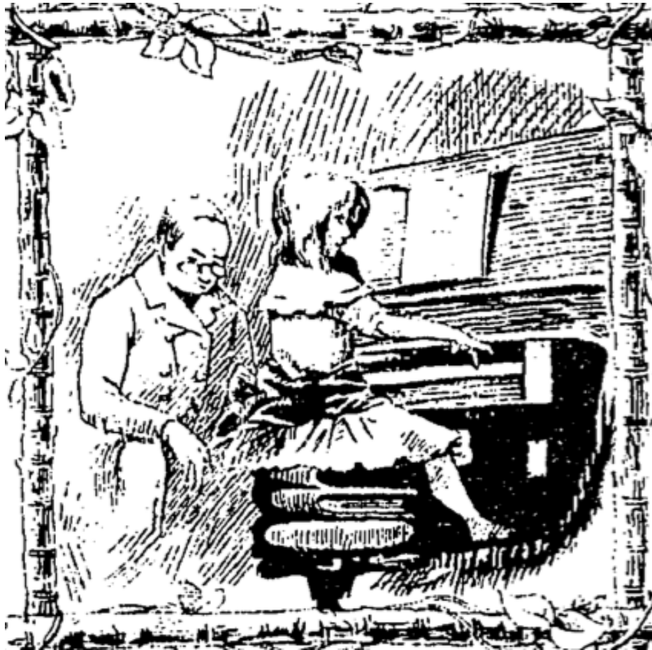
Figure 4.10. Cover page detail of Lack's Scènes enfantines depicting "La leçon de piano d'Yvonne."

After a five-finger scalar exercise in C major marked “L’Étude des classiques” (The study of the classics), Yvonne proceeds through a pedagogical medley comprised of excerpts from standard teaching repertoire, including sonatina themes by Johann Baptist Cramer (1771–1858), Jan Ladislav Dussek (1760–1812), and Muzio Clementi (1752–1832), the Allegro di molto e con brio theme from Sonata Pathétique—transposed to the key of E minor—by Ludwig van Beethoven (1770–1827), and the major theme from the last movement of the “Turkish” Sonata—transposed to the key of B major—by Wolfgang Amadeus Mozart