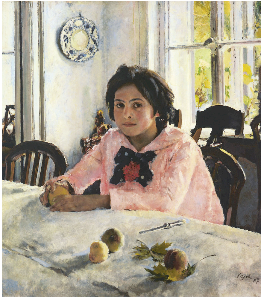
Figure 4.6. Girl with Peaches (1887) by Valentin Serov.

Serov completed his painting in Abramstevo, an artist's colony outside of Moscow, that had been cultivated and supported by Vera's father, industrialist and patron of the arts, Savva Ivanovich Mamontov (1841–1918). Here writers, painters, sculptors, actors, and composers as well as their families lived and worked together towards the goal of rejuvenating an authentic Russian art. A poem entitled Youth by Aleksey Stepanovich Khomyakov (1804–1860), a poet and theologian who frequented Abramstevo, demonstrates the extent to which