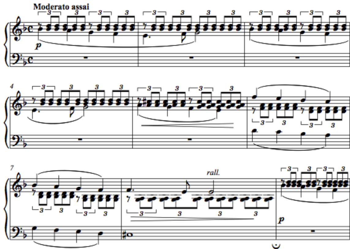
Figure 4.4. Harmonic ambiguity in opening theme of Ilyinsky's "Dreaming," mm. 1-9.

The next two pieces, "The old nanny" (No. 20) and "Story" (No. 21), continue the girl's journey to bed with idealized caricatures of folk storytelling. Musically these pieces make special use of modal harmonies, fragmented melodies, and dance gestures to link the child to an idealized Russian peasant culture. This alignment is particularly important, since the Romantic reframing of the child in many ways extended the Enlightenment reframing of