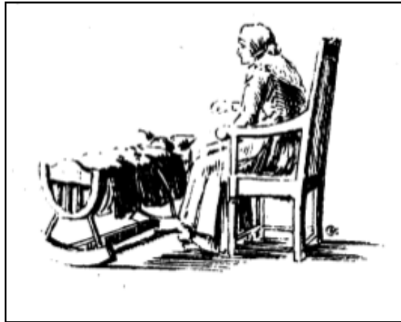
Figure 4.3b. Nostalgic illustration of traditional familial intimacy in Bonis' "Bébé s'endort," p. 19.