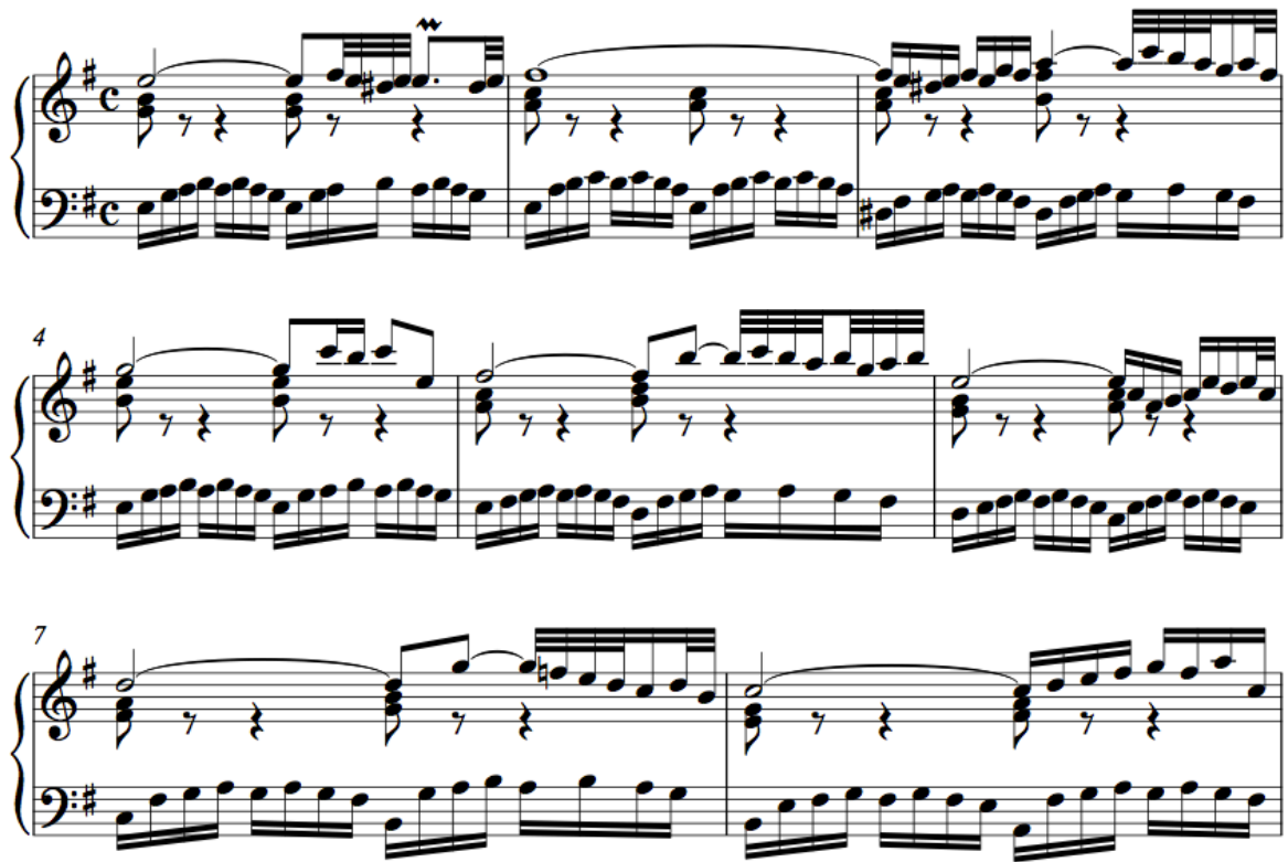
Figure 2.2b. Virtuoso coda as motivic development in Bach's Das wohltemperierte Klavier , Preludium in E minor, Presto section, mm. 23-25.