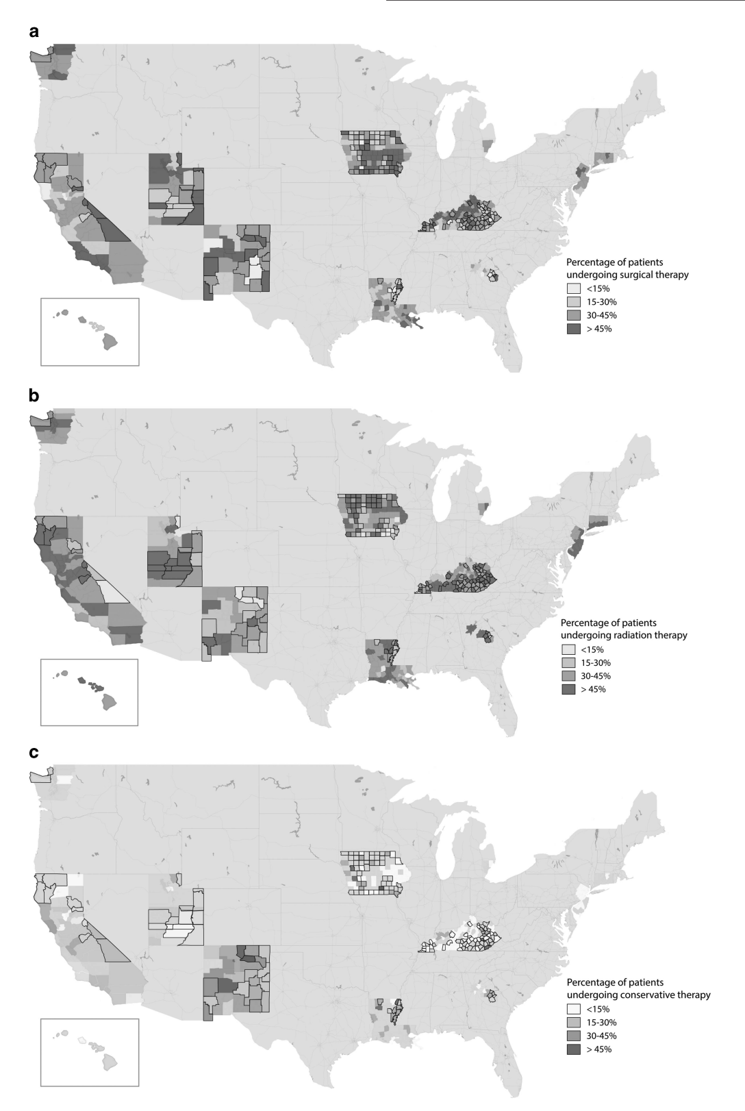
Figure 2. Proportion of men with localized prostate cancer in the SEER registry stratified by treatment type, 2005–2008. (a) Proportion of men in the SEER registry undergoing surgery by county. Thick borders indicate rural counties. (b) Proportion of men in the SEER registry undergoing radiation therapy by county. Thick borders indicate rural counties. (c) Proportion of men in the SEER registry undergoing conservative therapy by county. Thick borders indicate rural counties. SEER, Surveillance, Epidemiology and End Result.