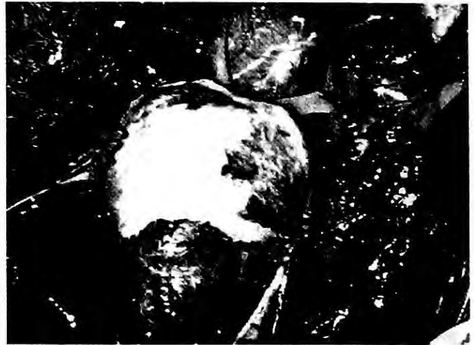
Figure 2. The heart of a red-winged blackbird showing extensive white uric acid deposits. This bird was offered aged 2% DRC-1339 soaked with sodium bisulfite diluted 1:25 with untreated rice. It died within 24 hrs of being offered the DRC-1339 bait.

Harvest Guard. There was no mortality observed with the aged ethyl cellulose or field bait within 120 hrs. The amount of DRC-1339 on the baits, along with baits that were not used on test because they were rained, upon is given in Table 3. Ninety percent of birds that died were positive for the presence of white uric acid deposits. Most (67%) had white deposits on both the heart and liver, with 4 birds (10%) having more than 50% of the heart covered (Figure 2). An additional 10% of birds were positive, but the amount of white uric acid deposition was so low they might have been mistaken for negative by an untrained observer.