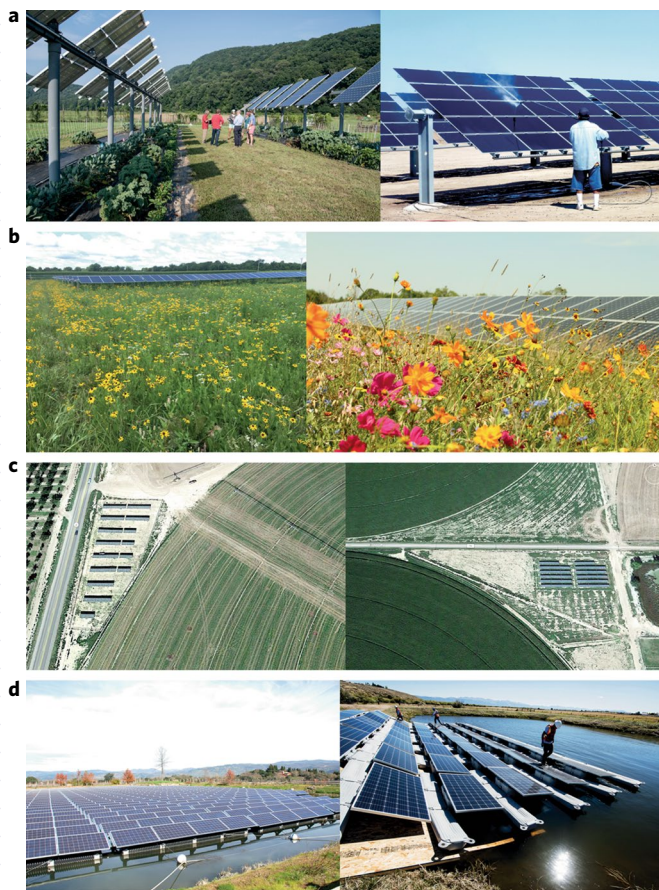
Fig. 3 | Techno-ecological synergies of solar energy and examples of techno-ecological synergistic outcomes. (a) Panel washing water inputs (left) on a photovoltaic (PV) installation are also inputs into agricultural productivity below, known as an agrivoltaic system leading to increased water-use efficiency, erosion prevention and maintenance of soil fertility, land sparing, and other beneficial techno-ecological outcomes (Chiba Prefecture, Japan). Compare this to panel washing (right) on an installation where water inputs are directed towards graded, compacted, and barren soil in California's Great Central Valley, which does not optimize techno-ecological synergistic outcomes, like PV module efficiency of food system resilience (Manteca, CA; for further discussion on water use efficiency in agrivoltaics, see Supplementary Box 1). (b) In the US states of Minnesota (left) and Vermont (right), land adjacent to croplands is developed with PV solar energy (1.3 MW, fixed tilt and 1.1 MW, single-axis tracking, respectively) and outplanted with low-growing flowering plants for native and managed pollinators that help increase agricultural yields, reduce management (i.e., mowing) costs, and confer the opportunity to produce honey and other honey-based commodities. (c) Center-pivot agrivoltaic systems occupy the corners of crop/pasture fields for solar energy generation but also produce the techno-ecological synergistic outcomes of air pollution reduction, land sparing, food system resilience, and others in Dexter, New Mexico (for further discussion on center-pivot agrivoltaics see Supplementary Box 2). (d) Floatovoltaic installations can contribute to local- and regional-scale agricultural resource needs while simultaneously enhancing water quality and water-use efficiency, a beneficial ecological outcome, as demonstrated by this floatovoltaic system in Napa, California (left) and this floatovoltaic system under construction atop a water treatment facility in Walden, Colorado (right; for further discussion on floating PV systems see Supplementary Box 3).

The use of land for energy and agricultural production necessitates novel metrics for valuation. The land equivalent ratio (LER) is a metric inclusive of yields and electricity generation (AVS crop yields / regular crop yield + AVS electricity yield / regular AVS yield), where LER > 1 is more effective spatially than separated crop and solar energy generation for the same area. A study of the LER of a durum wheat-producing AVS in Montpellier (France) found that the full and half density AVSs have LERs of 1.73 and 1.35 38 . Modeling in India on an AVSs where PV was integrated with grapes grown on trellises showed a 15-fold increase in overall economic returns compared to conventional farming with no reduction in grape yields 39 . Another simulation study in North Italy revealed solar panels confer more favorable conditions for rainfed maize productivity (a C4 plant) than full light, and LERs were always >1 40 .