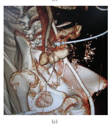
FIGURE 3: (a) Axial computerised tomography (CT) angiography image showing a branch of external iliac artery (EI BR) feeding the pseudoaneurysm (PS ANEU). (b) and (c) 3D reconstruction CT angiography images showing branch of the external iliac artery feeding the large bowel loops.

lower limb. No abnormalities of the venous system in the right lower limb were seen. On CT scan, a deformed right femoral head with postpinning defect, articular changes, and subluxation was visualized. After initial resuscitation, exploratory laparotomy was performed immediately with subsequent ligation of feeding vessel to the pseudoaneurysm and appendectomy (Figures 4 and 5).