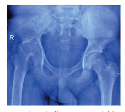
Figure 7: Radiograph of hip joint at 6-month follow-up.

with smooth than threaded K-wires. Usually the migration of K-wire is retrograde along the path of its insertion since this is the path of least resistance due to muscular movement and the smooth nature of the K-wire [2]. Antegrade migration of K-wire, though rare, has been reported in the literature. Several case reports have been reported on the migration of K-wire from shoulder joint to various intrathoracic organs such as aorta [3], heart [4, 5], lungs [6, 7], trachea [8, 9], mediastinum [10], neck [11], spleen [12], and spinal canal [13, 14]. In two of the cases migration of K-wires led to death of the patient [4, 6]. Few cases of migration from hip to heart [15, 16], liver [2], and popliteal fossa [17] have been reported. A single case of K-wire migration from left hand to the heart has also been reported [18]. In one of the cases where the K-wire migrated from hip to liver [2], there was no injury to the intervening abdominal structures in contrast to our case. Vascular injuries related to K-wire insertion have been reported in upper limb [3] but never in lower limbs. In a case reported by Rossi et al. [17], a K-wire migrated from hip to popliteal fossa, but no vascular injury resulted and the wire was found between semimembranosus and semitendinosus muscle. Thus, our case represents the first case report of Kwire migration which caused vascular injury and resulted in life-threatening injury to the patient. In addition, our case