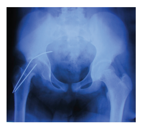
FIGURE 2: Postoperative radiograph shows intrapelvic migration of K-wire with remaining broken part of K-wire.

month prior to presentation for which he was taken to the center where first surgery was done. During this surgery, one of the K-wires broke and another could not be retrieved through the hip incision (Figure 2).