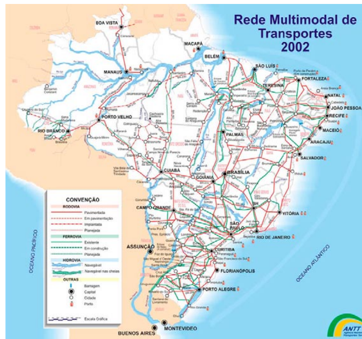
Fig. 3. Brazilian transportation network that represents ecological barriers for CPEC Project.