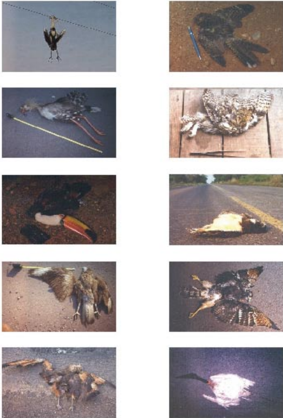
Fig. 4. Avian road-killed in CPEC (top-bottom; left-right): Gray-egret; Nightjar; Seriema; Striped-owl; Toco-toucan; Spectacled-owl; Crested-caracara; Sparrow-hawk; Savanna-hawk; Jabiru.