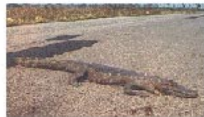
Fig. 6. Mammal and reptile road-killed species in CPEC (top-bottom; left-right): Field-deer; Jaguar; Grass-wild-cat; Common-otter; Brown-capuchin-monkey; Ocelot; Yellow-anaconda; Crab-eating-fox; Tegulizard; Yacare-caiman.