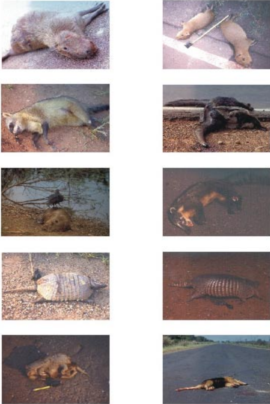
Fig. 5. Mammal road-killed species in CPEC (top-bottom; left-right): Capybara (adult); Capybara (offspring); Crab-eating-raccoon; Giant-anteater (female and offspring); Capybara and Black vulture; Coati; Yellow-armadillo; Common-armadillo; Naked-tailed-armadillo; Collared-anteater.