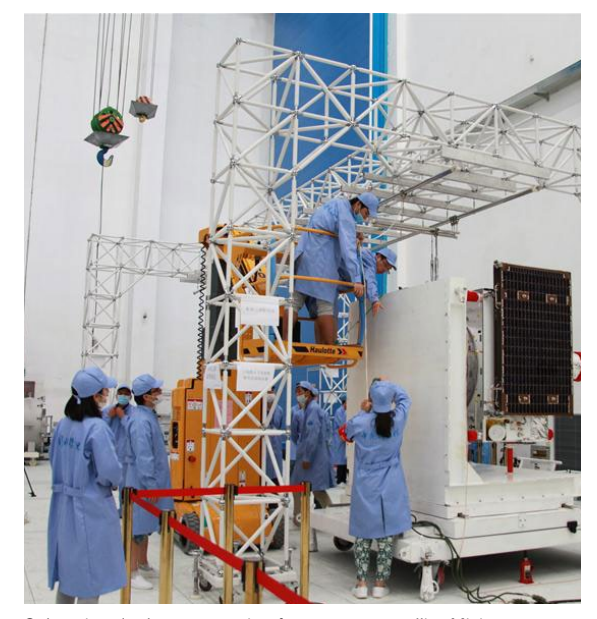
Solar wing deployment testing for quantum satellite Micius .

A sophisticated Chinese quantum communication system supports China's purported "<u>Harvest</u> <u>Now, Decrypt Later</u>" strategy, which siphons off large volumes of Internet traffic in the hope that it can be deciphered in the near future.<sup>10</sup> With other state actors assumed to be following suit, concern is growing about the fallout of an adversary being able to decode government and private sector communications.