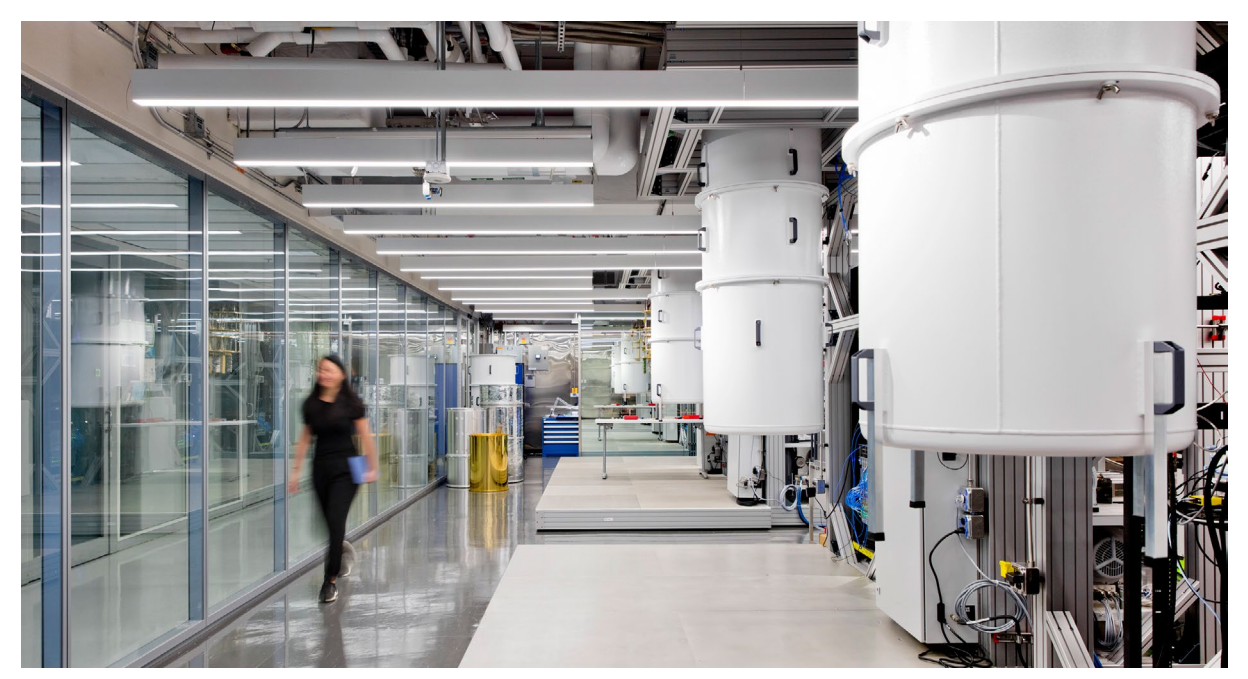
IBM Quantum Lab.

Western governments believe it is urgent to make headway in post-quantum cryptography. Indeed, some of the risks to network security that quantum networks may pose are actively being tackled by the U.S. Department of Commerce's National Institute of Standards and Technology. The booming field of post-quantum cryptography has attracted a steady stream of funding and has already <u>delivered</u> novel encryption systems that will hold up even against powerful quantum machines.<sup>20</sup>