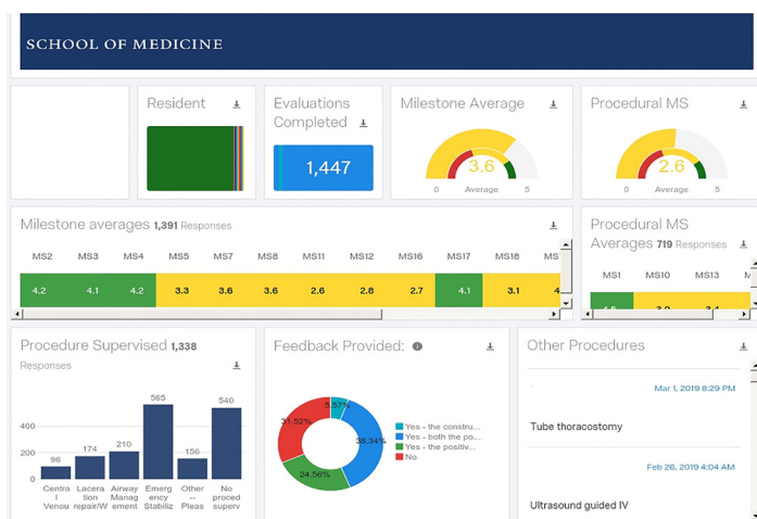
Figure 2. Sample of dashboard screenshot.

Figure 2 shows a visual representation of compilation of all feedback given for an individual or a group of residents over a time period that can be selected. An additional feature of the dashboard is the ability to include evaluation data from other sources, such as evaluations of residents by nurses. Those sources can use a different set of evaluation questions, as they do at our institution, as long as they use the Qualtrics survey tool. Access to the survey is granted via an e-mailed link to nurses. The use of this software was donated for the pilot of this project by Qualtrics.