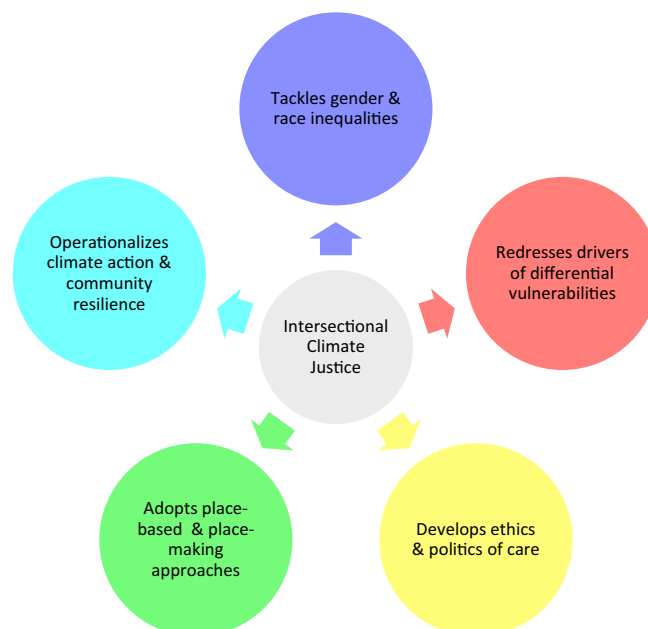
Fig. 2. Intersectional climate justice: a conceptual framework for urban adaptation planning.

These deeply embedded injustices of historic racism and sexism are reflected in contemporary communities' capacity to cope with and adapt to climate change. There is growing recognition that the impacts of climate change have a disproportionate effect on women, Black, Indigenous, and low-income communities (Costello et al., 2009; IPCC, 2012). Research has shown that these groups tend to be more vulnerable to the effects of climate change because they are less likely to own land and resources, have less education and training, less access to institutional support, health services, and information, and fewer opportunities to participate in decision-making (Alston and Whittenbury, 2013; Denton, 2002; Nelson, 2012; Röhr, 2006). Despite that, we do not suggest that intersectional climate justice calls for reproducing simplistic portrayals of poor, Black, and Indigenous women as the main victims of environmental degradation while at the same time reinforcing a narrative that they have greater environmental awareness (Johnsson-Latham, 2007), positioning them as 'eco-warriors' (Resurrección, 2017), and community leaders towards resilience (Enarson, 2013; Veuthey and Gerber, 2012). Such a simplified approach to underlying race and gender inequalities attributes yet another responsibility to the already long list of caring roles. Rather, an intersectional lens pushes back against reductionist narratives to the extent that they