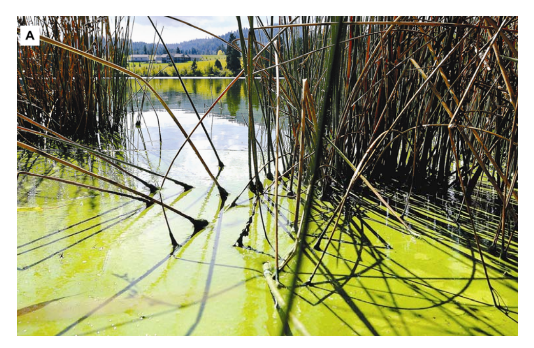
Figure 1. Algal bloom caused by the cyanobacterium Microcystis aeruginosa in Middle Foy Lake near Kalispell, Montana in September, 2010. [16] ( A ); Confirmation of this bloom as M. aeruginosa microscopically (cell size 2–3 \mu m) and detection of high concentrations of the cyanobacterial hepatotoxin microcystin-LA in surface scum was performed by scientists at the University of California, Santa Cruz ( B ).

Death from microcystin intoxication has been reported in fish [1,2], birds [2,3], companion animals [4–6], livestock [7,8], wildlife [9,10] and humans [11,12], and significant blooms can cause widespread morbidity and mortality [13]. Microcystins are structurally diverse cyclic heptapeptides that are primarily considered as hepatotoxins [14], although the gastrointestinal tract, kidney and other organs are also susceptible to toxin-mediated damage [15]. Human and animal exposure to microcystin typically occurs through ingestion of contaminated water or food, or by licking contaminated fur.