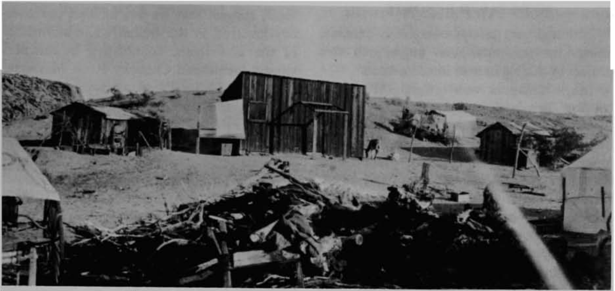
Fig. 3. "Indian Village Feb. 19, 1923."