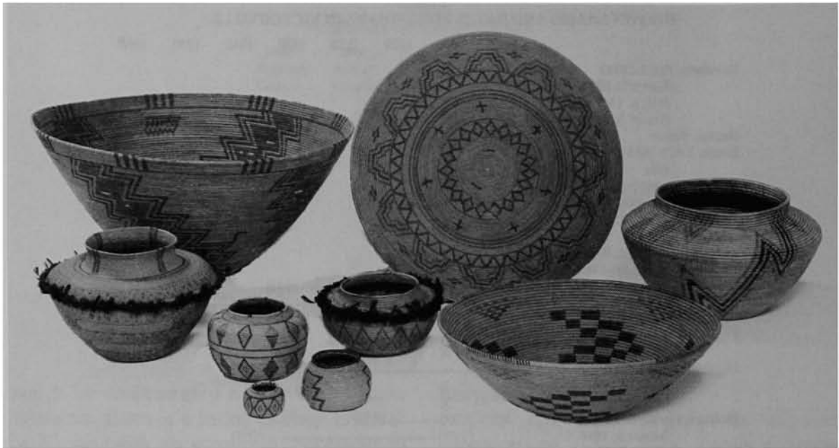
Fig. 2. Sampling of baskets made by Victorville weavers showing range of shapes, sizes, materials, and designs.