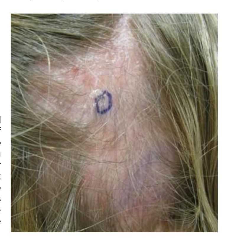
Figure 1. Clinical presentation. Original patch of alopecia on the right temporal scalp with biopsy site marked.

The patient's inflammatory bowel disease was well controlled with the combined therapy of azathioprine 125 mg PO daily and adalimumab 40 mg IM every 2 weeks for approximately 2.5 years. Previous Crohn's treatments included azathioprine, methotrexate, and infliximab, all discontinued secondary to lack or loss of efficacy. Three years previous, she had been evaluated by the department of dermatology for biopsy-proven, secondarily impetiginized, seborrheic dermatitis involving the scalp, postauricular neck, axillae, inframammary folds, and upper chest. For this, she was given topical mupirocin and triamcinolone