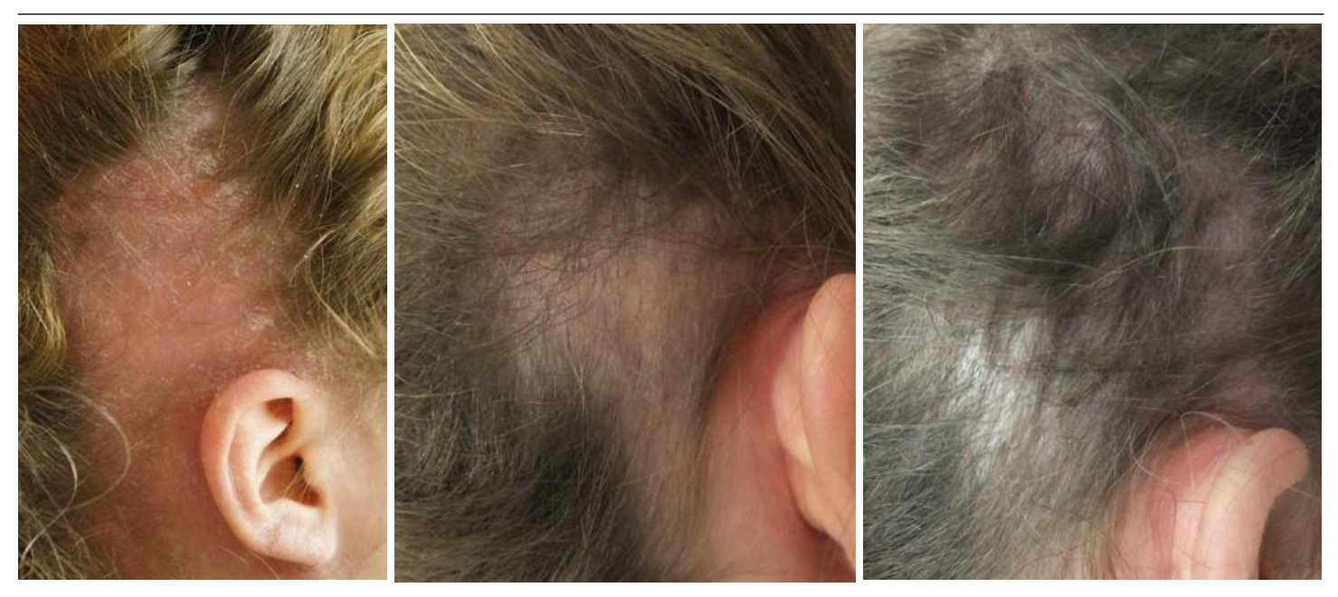
Figure 3. (Left to right). Progressive resolution of alopecia with photos taken at the time of monthly intralesional triamcinolone acetonide injections.

No infectious organisms were noted on periodic acid-Schiff-diastase (PASD) stain.