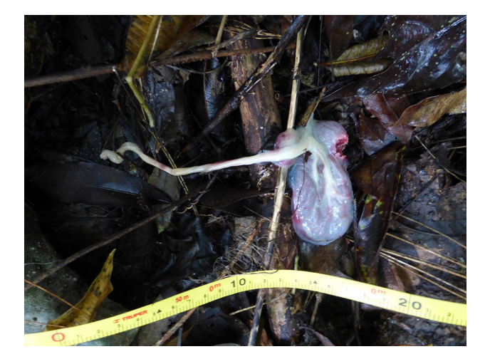
Fig. 2 Photograph of placenta of an Alouatta pigra female, found after a night birth at Palenque National Park on July 19, 2015.