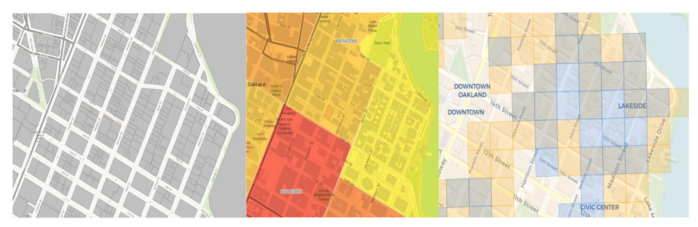
Figure 1. The tool can combine data from different geographies, such as block level (left) and census tract level (center) into 100x100 meter pixels for analysis (right).