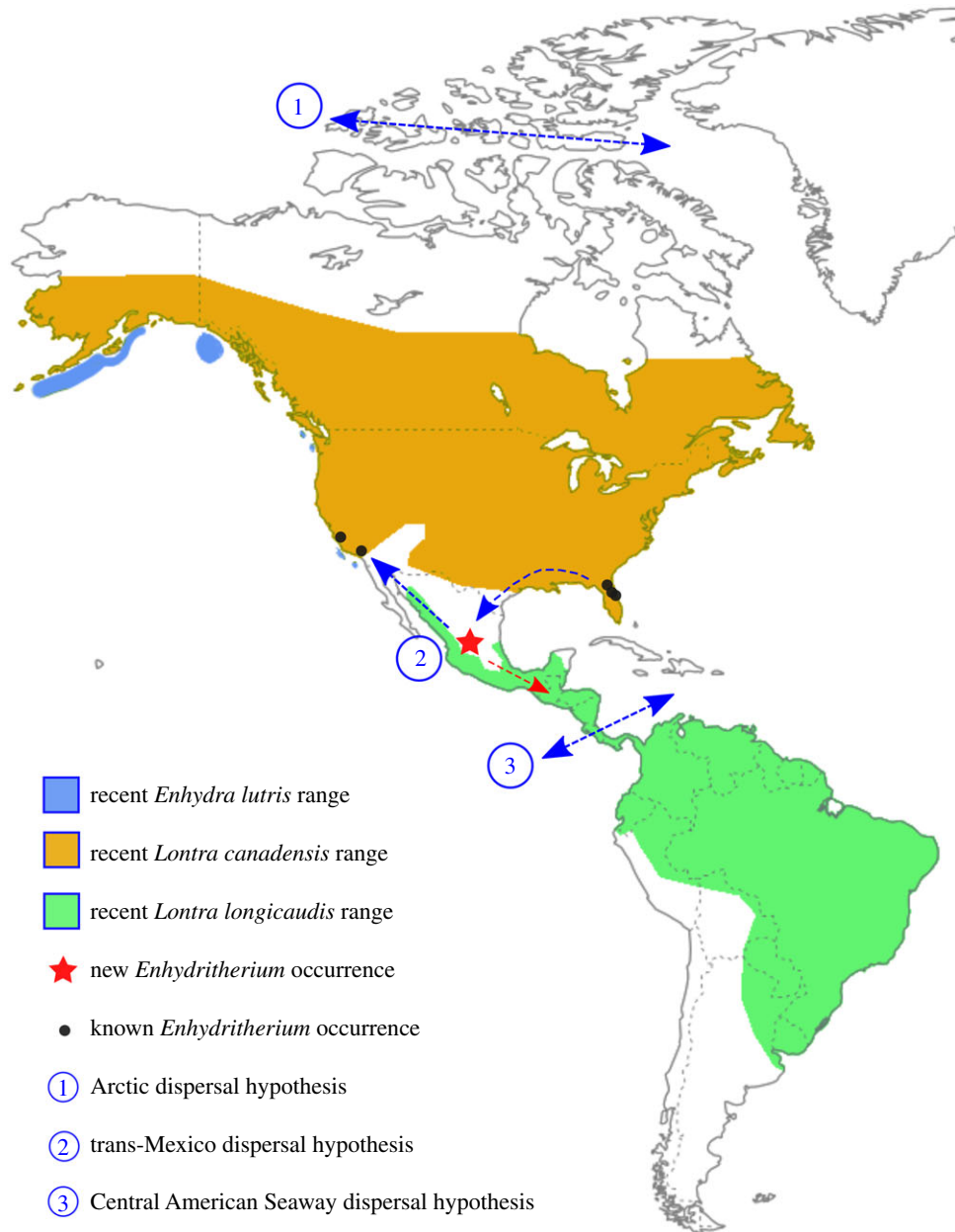
Figure 1. Map of Enhydritherium localities with extant Lontra and Enhydra ranges. Previously proposed dispersal hypotheses are mapped along with the trans-Mexico dispersal hypothesis supported by the new discovery. Modern species ranges taken from the International Union for Conservation of Nature (IUCN) [1]. Red arrow indicates possible southern dispersal route with riparian habitats.

Union for Conservation of Nature (IUCN) classifies L. longicaudis as near-threatened, and E. lutris as endangered [1].