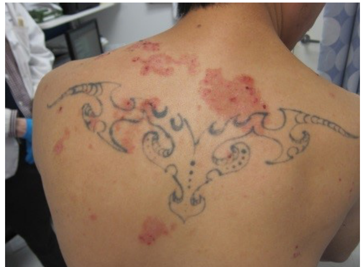
Figure 1. Upper back with scattered, erythematous patches with overlying erosions

Epidermolysis bullosa acquisita (EBA) is a rare, acquired, chronic subepidermal blistering condition