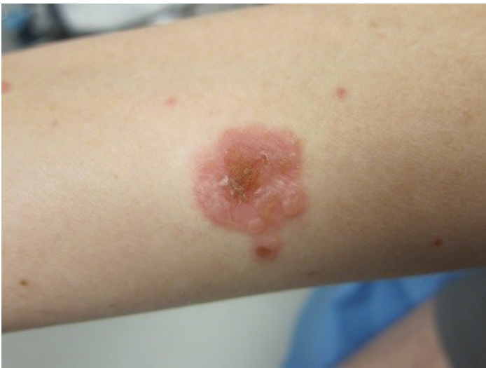
Figure 2. Ventral forearm with central erosion and vesicles at the periphery

that is characterized by autoantibodies targeting type VII collagen. Type VII collagen is located in the basement membrane and is the major component of anchoring fibrils, which serve as adhesion structures that connect the papillary dermis to the lamina densa [1]. Type VII collagen is found not only in skin, but also in the basement membrane of cornea, oral mucosa, cervix, esophagus, colon, anus, and chorioamnion [2]. The prevalence of EBA is estimated at 0.2 per one million people [3]. Although no racial or gender predominance has been identified, EBA may have a higher prevalence in Korean populations [4]. Most cases of EBA begin between the fourth and fifth decades, but there have been cases reported in pediatric patients [5].