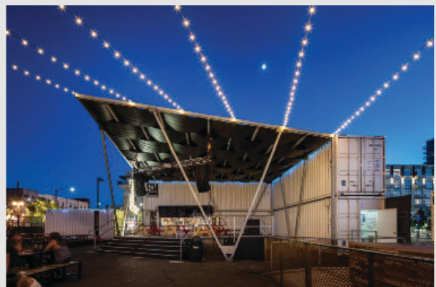
Figure 1: Completed stage for large music venues

The original designs had only a small expectation for music. Initially the site was meant to have small gatherings for music, but later the site evolved into a very music heavy venue. These concerts would bring upwards of 1,500 people to Quartyard, and fortunately the Quartyard’s conditional use permit covered events at this scale. Lowenstein stated, “We didn’t expect this amount much focus on music, but we just went with it. We are fine if people want to use this space differently, since we designed it for the people. People have brought many different ideas to use in this space that we would have never thought of ourselves and we embrace it” (Lowenstein).