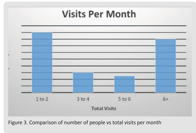
Figure 3. Comparison of number of people vs total visits per month

huge split between the data which yielded some interesting results. As shown in Figure 3, 40% of people interviewed said one to two times per month, 13% claimed three to four times per month, 11% claimed five to six times per month and 36% people noted six or more times per month. One interesting dynamic which appeared during many interviews was not a question originally asked during the research. More than 60% of the people interviewed said it was their first time there also stated they were told to visit by friends and they would definitely be coming to Quartyard more often. This “word of mouth” success promotes to a growing trend of social capital building.