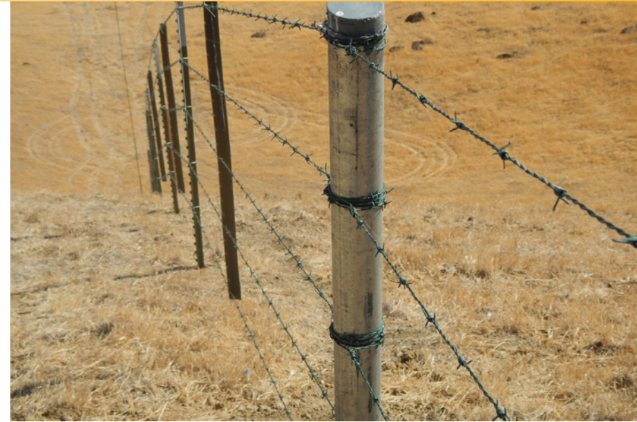
5-strand barbed wire fence.

Fencing can be permanent or temporary, and it should be appropriate for containing the species of livestock on a given site. Ranchers must comply with “lawful fence” standards as well as safety requirements for electrified fencing in the California Food and Agriculture Code.