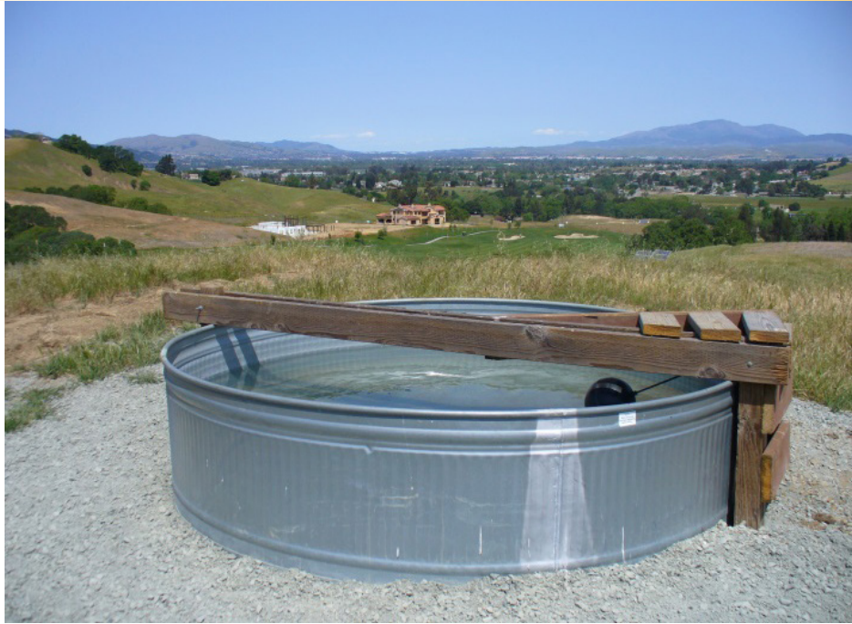
Livestock water trough.

water to troughs provides a cleaner, healthier source of drinking water that maintains livestock performance and health (see the publication in this series Cows Need Water, Too (UC ANR Publication 8525 http://anrcatalog.ucanr.edu/Details.aspx?itemNo=8525 ).