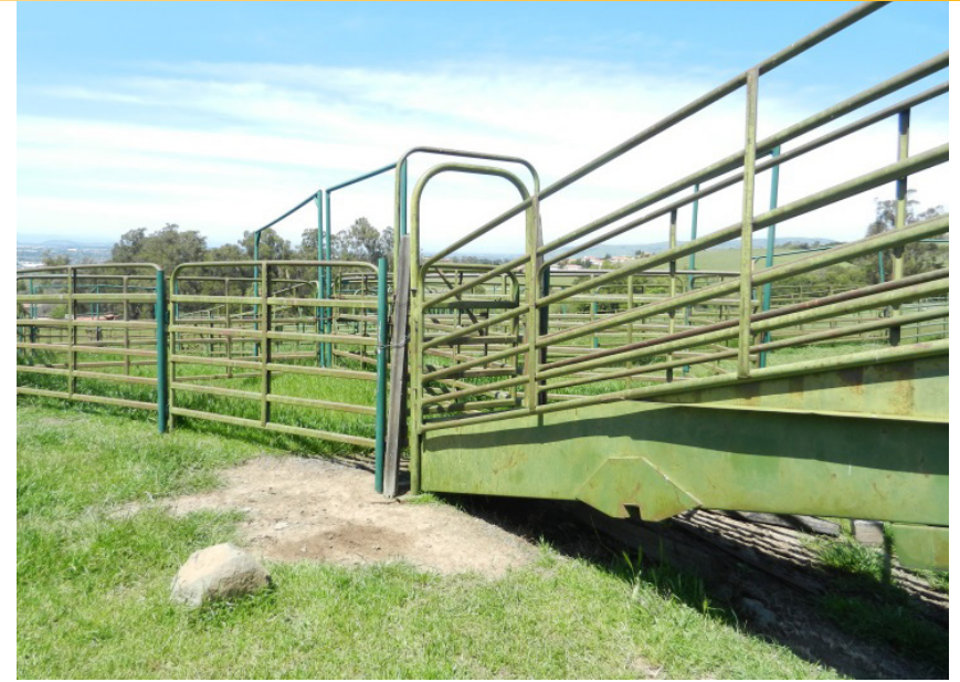
Livestock working facilities with loading chute.

When multiple pastures are developed on a single property, each pasture must have enough water available at any one time to support the number of head grazing in it. In fields with significant elevation differences, one water source may not be adequate, particularly if it is at the bottom of a slope. Livestock should not have to travel more than \frac{1}{4} to \frac{1}{2} mile to water in steep, rough terrain or more than 1 mile on level or gently rolling ground. Livestock may overuse a site rather than walk greater distances between water and abundant forage. Conversely, although a pasture may have forage, unless there is an adequate, reliable supply of drinking water, livestock grazing may not be feasible. The location and number of watering sources can also be used to improve livestock distribution.