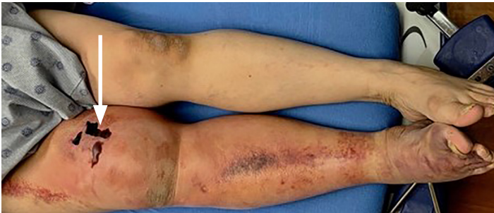
Image 1. Large area of ecchymosis of the right lower extremity with hemorrhagic bullae formation (arrow).

Ultrasonography revealed a 20 centimeters (cm) x 4 cm x 14 cm hypoechoic fluid collection in the right medial thigh (Image 2). Computed tomography of the thigh demonstrated a hyperdense foci within the fluid collection suggesting internal