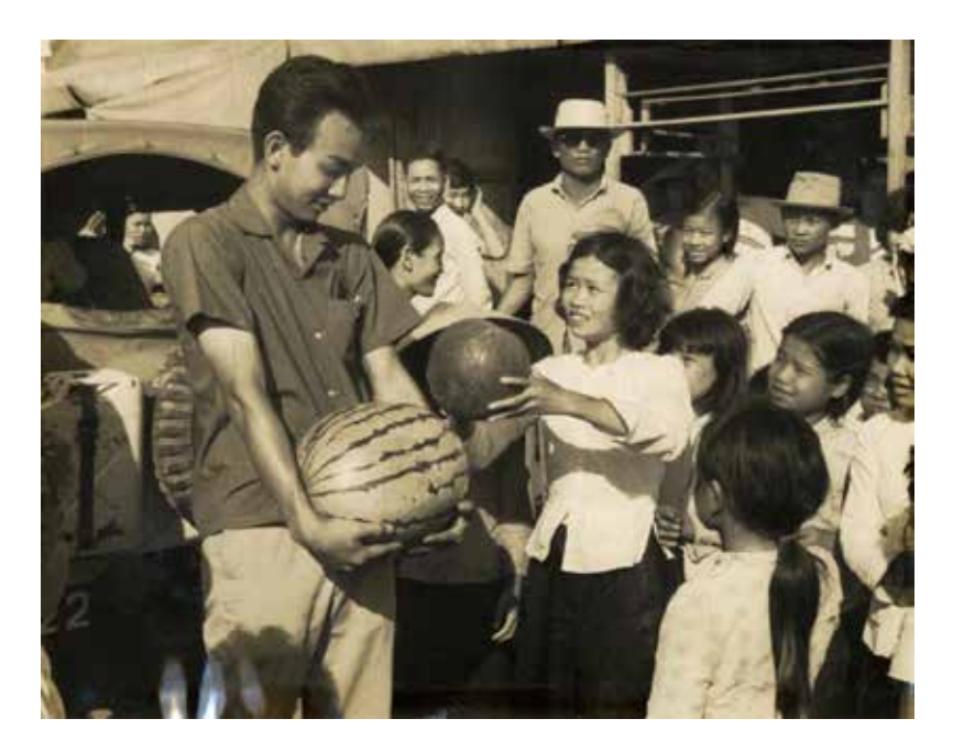
Figure 3. Photograph comparing the American variety "Dixie Queen" watermelon ( left ) at 14 kilograms (more than 30 pounds) introduced by the Taiwanese agricultural team compared to a native variety ( right ) in Dinh Tường.<sup>26</sup>

Taiwanese teams expanded beyond rice to include other food crops, including onions, carrots, garlic, sweet potatoes, watermelon, soybean, cabbage, lettuce, peanuts, sorghum, corn, and mung beans (figure 3). Varieties were sourced from countries throughout the Global North and South, such as the United States, Australia, and Korea. Experiment stations run by Taiwanese compared varieties, which could include up to twenty-eight varieties, as in the case of onions ranging from Texas Early Grano 502 to Early Lockyer Brown.<sup>25</sup>