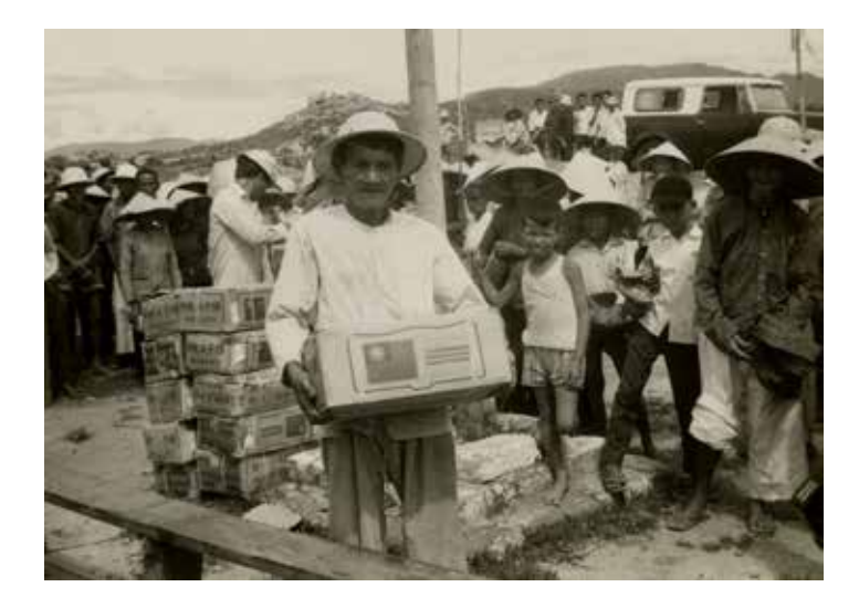
Figure 9. A Vietnamese recipient of Taiwanese aid. The box is adorned with the two flags of the Republic of China and Republic of Vietnam.<sup>48</sup>

chemical composition, but was also a means to showcase the humanitarian actions and goodwill of Taiwanese assistance. Boxes containing vegetable seeds were adorned with flags of the ROC and RVN side by side, showing the origins of the gift along with partnership for the RVN peoples (figure 9).