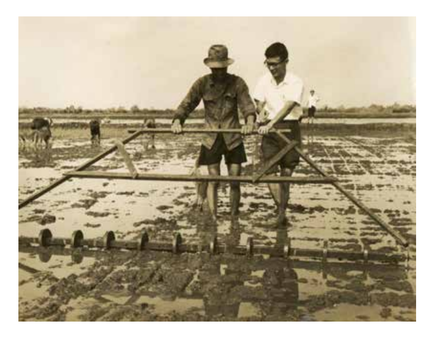
Figure 2. A Taiwanese technician teaching a Vietnamese farmer how to use an implement to mark rice spacing in order to maintain ideal distance while transplanting rice seedlings.<sup>20</sup>

Rationalization also extended to cultural practices, such as maintaining precise and consistent distance between rice seedlings to ensure enough room for growth without underutilizing much needed land. Taiwanese farmers introduced new agricultural implements that could aid Vietnamese farmers in easily marking distances through imprinting grids in the soil (figure 2).