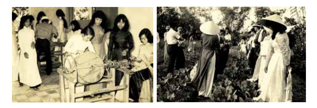
Figure 7 ( left ). "Home improvement agents" shown here are using a straw-rope making machine at a Taiwanese demonstration center in Biên Hòa.<sup>45</sup>

Taiwanese government promotion of married–women's labor to fuel rural home-based production that formed the "satellite factories" of Taiwan's later industrialized economic growth (Hsiung 1996). In Vietnam, women played a prominent role in rural areas. Zhang Jiming indicated that by the time of his arrival in Vietnam, most men were involved in the ongoing war, and thus women often participated in extension and demonstration activities (figure 8).<sup>44</sup>