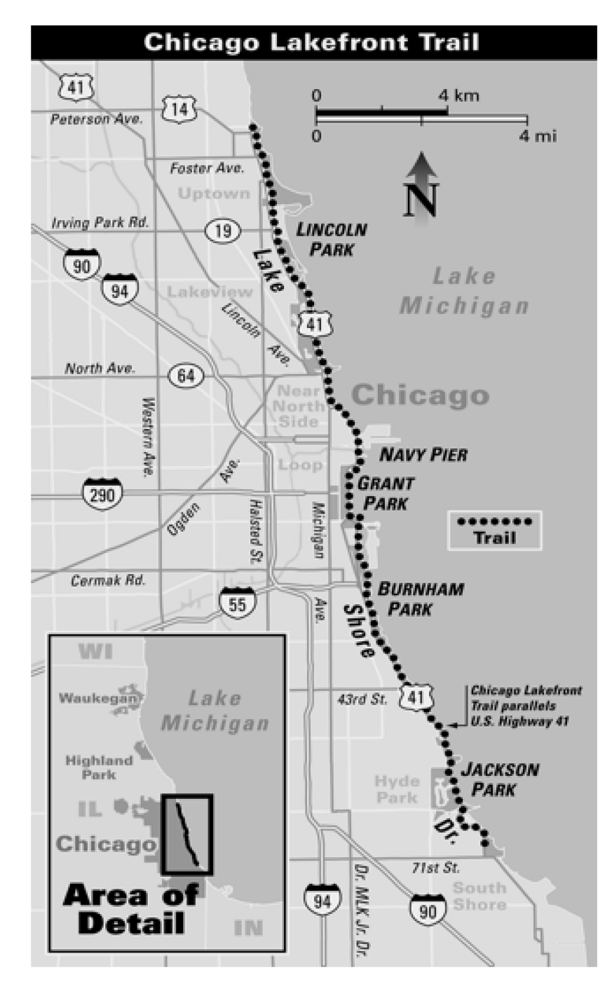
Figure 1. Chicago Lakefront Trail