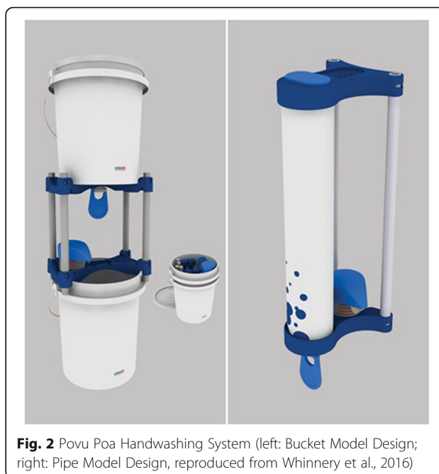
Fig. 2 Povu Poa Handwashing System (left: Bucket Model Design; right: Pipe Model Design, reproduced from Whinnery et al., 2016)

To motivate handwashing behavior in schools, we designed an intervention based on disgust and social norms, both of which are strong drivers of handwashing behaviors [24, 27]. We developed an intervention design based on an approach shown to be effective among