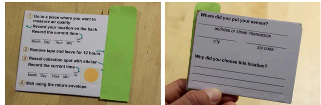
Figure 3. Sensor front and back.

longer and shorter exposure times: shorter deployments might not collect enough particles to show local variations; deployments of several hours might interfere with participants’ schedules; and longer deployment (over 12 hours) might face weather challenges (rain, snow, etc.). After testing different instantiations of the sensor throughout our city for varying amounts of time (from 15 minutes to 24 hours), we decided on an initial design consisting of note-cards, clear tape, several stickers (for sealing the sample), and an exposure time of 2 hours.