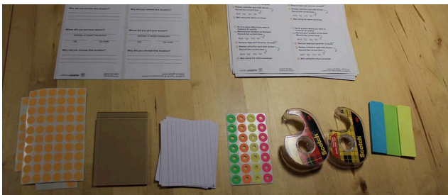
Figure 2: Materials needed to assemble a particulate trap.

Using paper and acrylic as a base, we experimented with several sticky materials to collect particles, including tape and Vaseline. We also considered the tradeoffs between