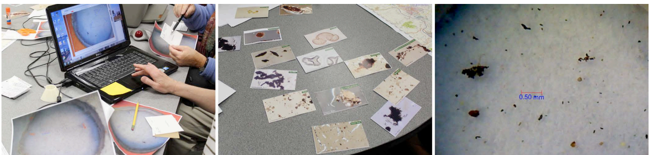
Figure 4. Air quality workshop: measuring and counting particles; particle information cards; participant's microscope data.

To evaluate our design, we intentionally mailed the particulate sensors without any additional instructions,