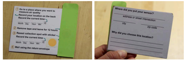
Figure 3. Sensor front and back.

longer and shorter exposure times: shorter deployments might not collect enough particles to show local variations; deployments of several hours might interfere with participants’ schedules; and longer deployment (over 12 hours) might face weather challenges (rain, snow, etc.). After testing different instantiations of the sensor throughout our city for varying amounts of time (from 15 minutes to 24 hours), we decided on an initial design consisting of note-cards, clear tape, several stickers (for sealing the sample), and an exposure time of 2 hours.