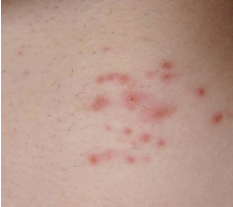
Figure 1. Follicularly-based papules, some eroded and crusted, clustered on the inner upper thigh

The patient began a course of valacyclovir 1,000 mg three times daily. Three days after starting therapy she reported improvement in burning and pruritus. Two weeks following her diagnosis, the patient's eruption had completely resolved with no post-herpetic neuralgia.