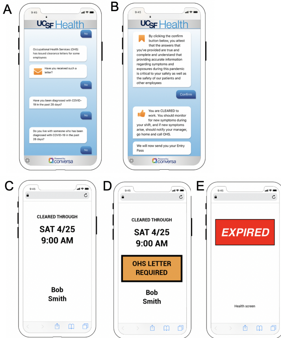
Figure 2: Chatbot screenshots. A. Exposure questions; B. Attestation and clearance; C. Clearance pass; D. Clearance pass requiring letter from Occupational Health Services; E. Expired pass