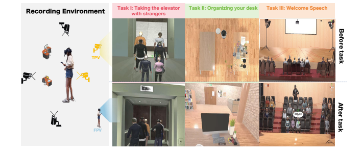
Figure 2: Three tasks of PersonalityScanner simulator.

According to research findings (Kumari, Williams, Gray, et al., 2004), personality traits such as extraversion, conscien-