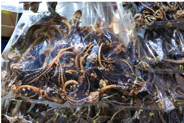
Fig. 1. Tylototriton shanjing being traded at a market in Hainan in August 2019. This is one of the 40 bags available for sale despite being a nationally protected species in the People's Republic of China.

We recommend that wild individuals of species listed as threatened on The IUCN Red List of Threatened Species (i.e., Vulnerable, Endangered, and Critically Endangered; IUCN, 2020), as well as species listed as Data Deficient and Not Evaluated, should not be legally traded or used without approval from relevant institutions, and never in breach of conservation requirements for the species. Specifically, for species not yet commercially used, or used on a small scale, it would be beneficial to issue and enforce a strict ban. For species that have already been legally commercially farmed and traded at large scales, an impact evaluation on how best to shift to sustainable farming should be conducted including evidence-based recommendations for levels of sustainable use, e.g. through population modelling. A conservation plan with a standardised and regulated methodology should be incorporated into breeding programs for each species. In addition, we recommend that only local native species be farmed to mitigate the risk of introduction and pathogen